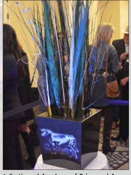
► Curtis and Ann Long of Briarwood Angus Farms purchased the final granite planter of the Building an Angus Legacy! Project.