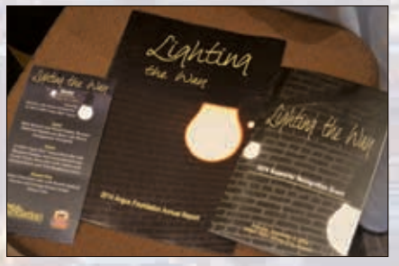
► Themed "Lighting the Way," the event honored Angus Foundation supporters who have contributed $250 or more during the past fiscal year.