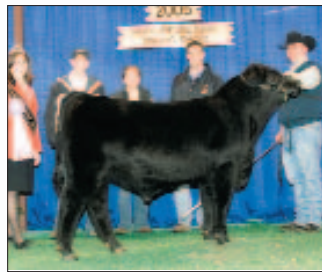
► Reserve senior calf champion, MSU Bushwacker 502 , by Michigan State University, East Lansing, Mich.