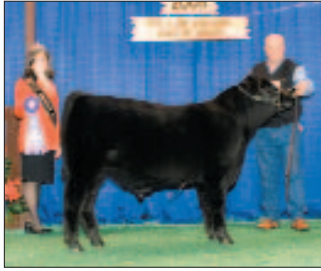
► Spring calf champion, WAF Future Direction 5100 , by Weaver Angus Farm, Peoria, Ill.