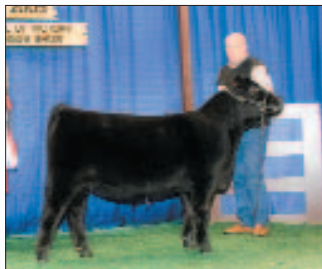
► Reserve spring calf champion, WAF Missie 5104 , by Weaver Angus Farm, Peoria, Ill.