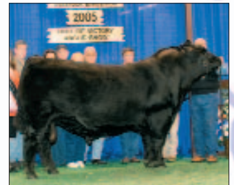
► Reserve senior champion, Lynnbrook Dateline 363 , by Weaver Angus Farm, Peoria, Ill.; Lynnbrook Farms, Williamsfield, Ill.; and Aden & Bock Farms, Hanna City, Ill.