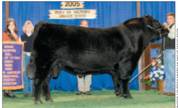
► Grand champion bull, QLC LaGrand Forum , by Fluharty Farms LLC, Gause, Texas; Quirk Land & Cattle Co., Hastings, Neb.; and LaGrand Angus & Hereford Ranch, Freeman, S.D.