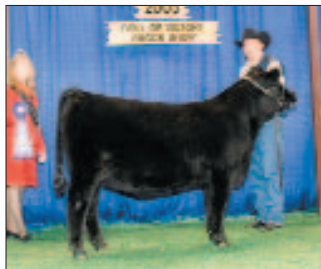
► Winter calf champion, EXG Forever Lady 5309 , by Express Angus Ranches, Shawnee, Okla.