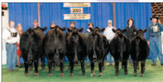
► First-place breeder's best six head, by Express Angus Ranches , Shawnee, Okla.