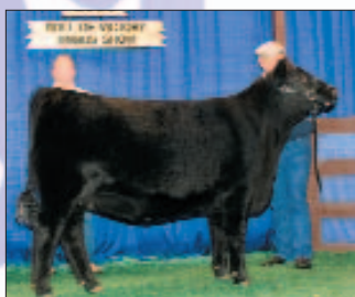
► Intermediate champion, Champion Hill Peg 4145 , by Boruff Farms, Sparta, Tenn., and Champion Hill, Bidwell, Ohio.