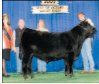
► Reserve spring calf champion, LaGrand Special Design 532 , by LaGrand Angus & Hereford Ranch, Freeman, S.D.