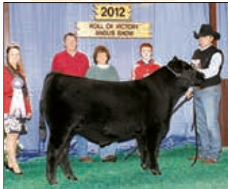
►Spring calf champion, CKF Duke 202 , by Herr Angus Farm, Nottingham, Pa.