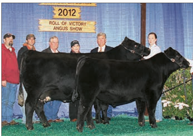
► Grand champion cow-calf pair, JKS Miss Cheyenne 2267 .