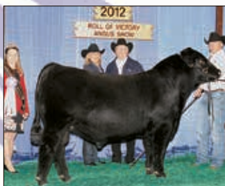
►Reserve senior calf champion, EXAR Post Time 5091B , by Express Angus Ranches.