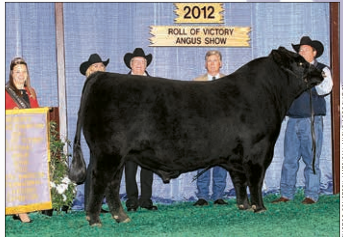
► Reserve grand champion bull, EXAR Stoney 0262B .