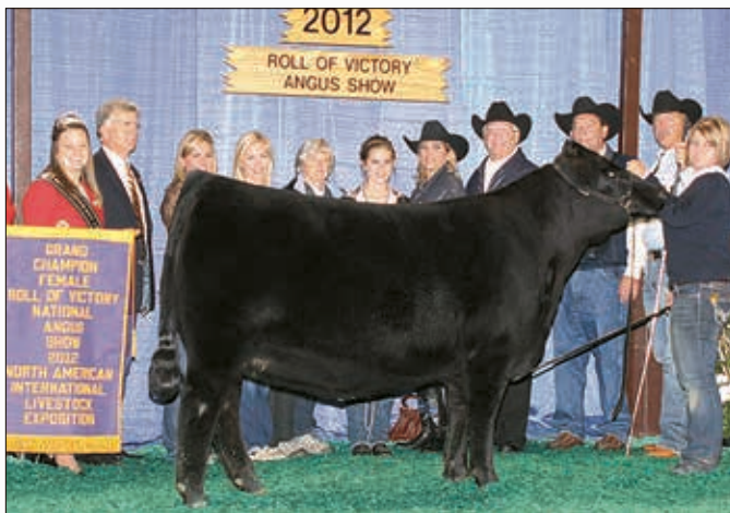
► Grand champion female, EXAR Envious Blackbird 1760 .