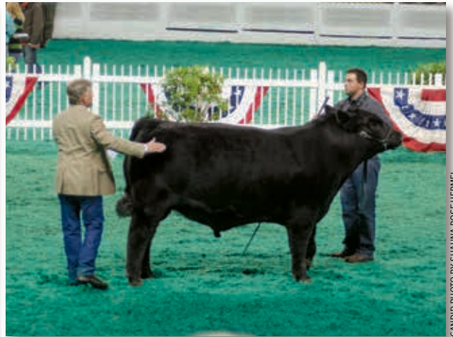
►VA First Round was selected as grand champion bull right after the crowning of Miss American Angus.