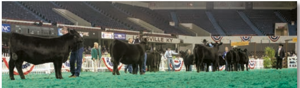
►Tuesday 179 females strolled across green shavings for the ROV female show.