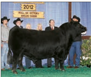
►Reserve senior champion, Silveira's Watchout 0514 , by Silveira Bros., Firebaugh, Calif.