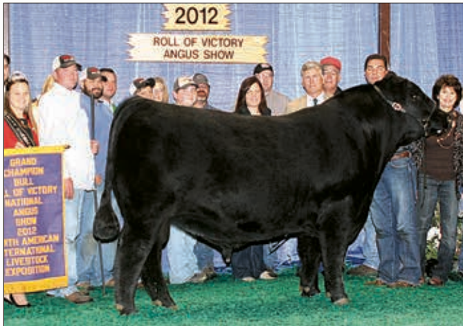
► Grand champion bull, VA First Round .