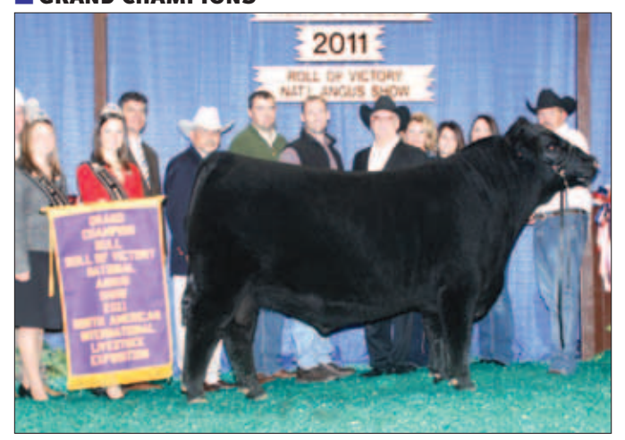
► Grand champion bull, Dameron First Impression .