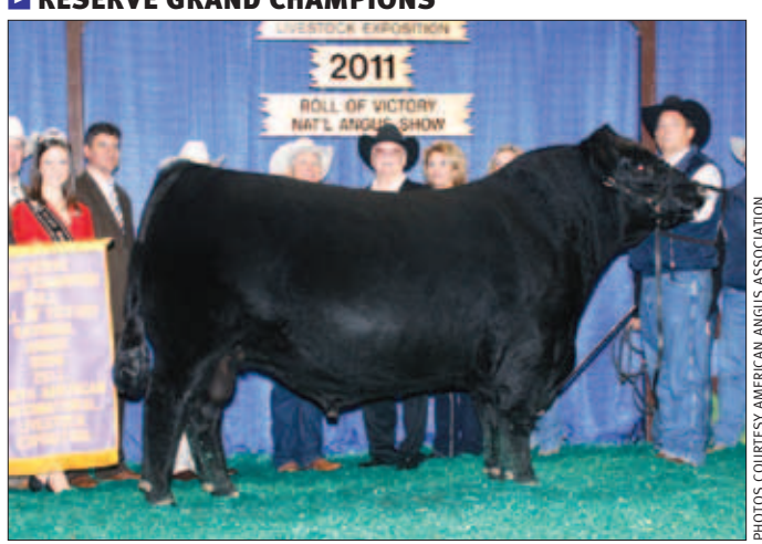
► Reserve grand champion bull, EXAR Wanted 9732B .