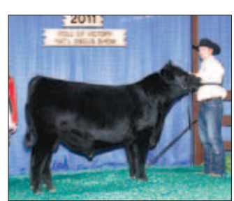
► Winter calf champion, Top Line Kayak 111 , by Top Line Farm, Tremont, Ill.