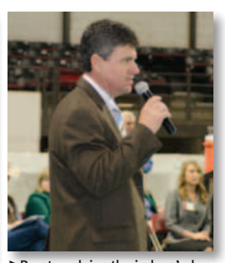
▶ Brost explains the judges' placing of a class during Monday's ROV bull show. The judges alternated in giving reasons to the audience gathered at the Kentucky Fair & Exposition Center.