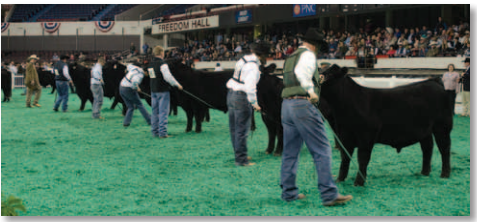
▶ Division winners line their bulls up for selection of the grand champion bull. Exhibitors showed 35 Angus bulls.