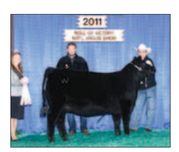
► Reserve senior calf champion, Whitestone Lady Z270, by Whitestone Farm, Aldie, Va.