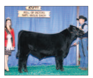
► Reserve spring calf champion, DAJS Authentic 442 , by Katy Satree, Montague, Texas.