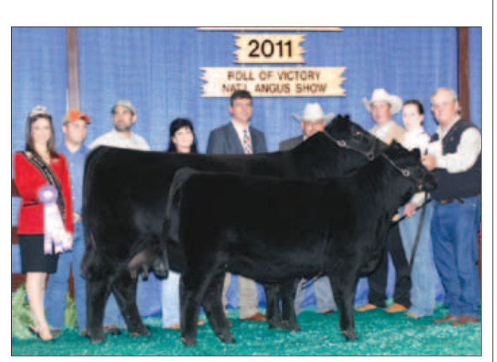
► Grand champion cow-calf pair, JKS Miss Cheyenne 4209.