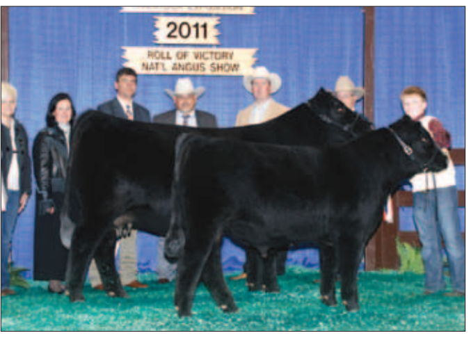
► Reserve grand champion cow-calf pair, APS Forever Lady Ruth.