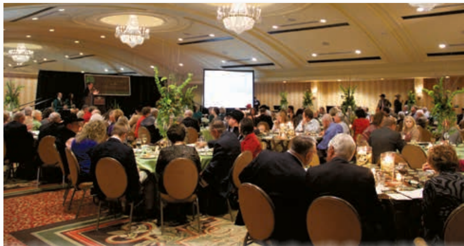
►Nearly 300 supporters who contributed $250 or more during the past fiscal year attended the Angus Foundation's 2013 Supporter Recognition Event Nov. 16 at the Crowne Plaza Hotel in Louisville, Ky.