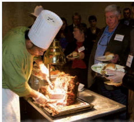
► A reception before the event offered a carving station and viewing of a 1/3-scale replica of the limited-edition granite planter that was featured for display-only purposes at the event.