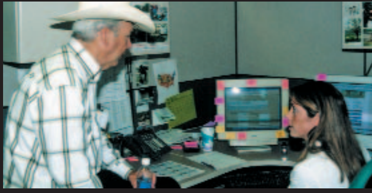
► Participants toured Association and API offices Wednesday afternoon. Producers said they were glad to visit with and meet people they had only talked to on the phone. Staff members took the time to chat and answer questions.