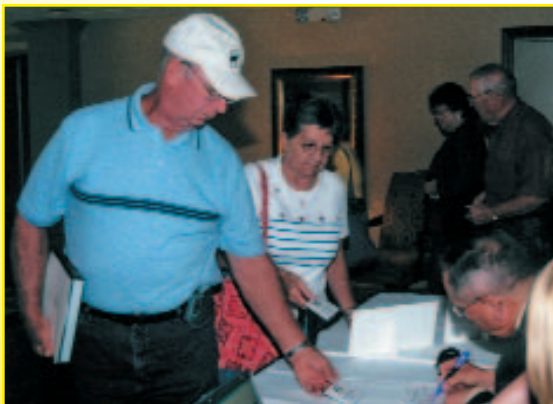
► The National Angus Conference & Tour drew 320 people from 27 states and three foreign countries to Missouri to see Angus cattle and focus on the breed's future.