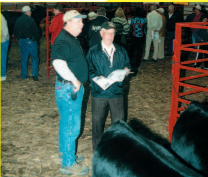
► Producers from across Missouri gathered at Ol' MacDonald's Farm in Savannah Wednesday evening to showcase their genetics. Conference participants saw great cattle and enjoyed a CAB dinner.