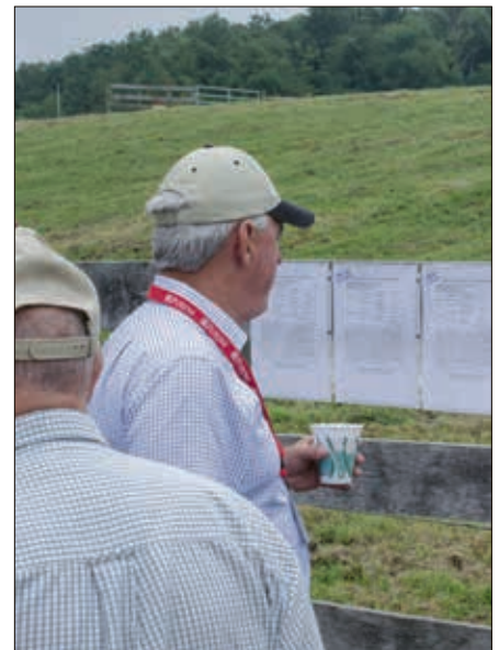
► Tour participants could view cattle up close and examine their pedigrees.