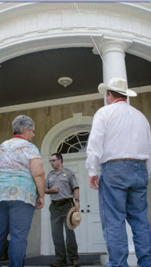
► Participants chose between touring the Vanderbilt Mansion or the Franklin Delano Roosevelt home.