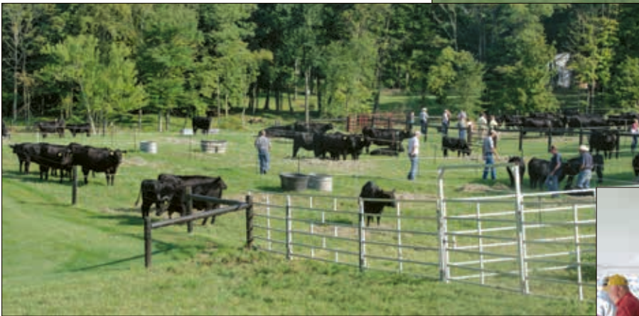
► Right: Tour attendees enjoy a steak dinner and the opportunity to attend the sale at Trowbridge Farms Thursday evening.