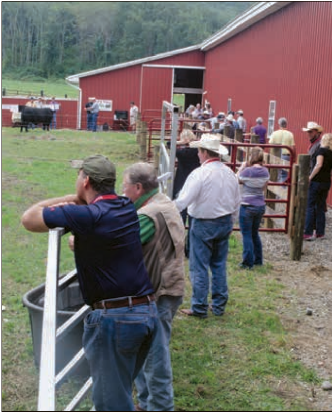
► Tour participants could evaluate several ranches' cattle at the Walbridge Farm and Market stop.