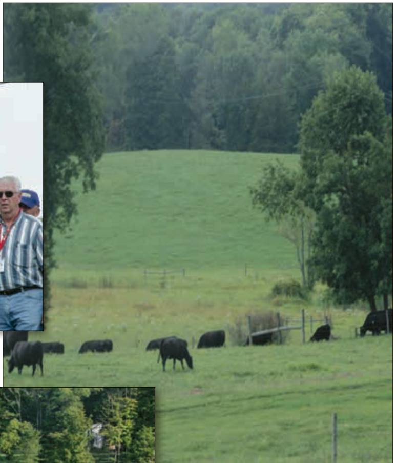
► While genetic selection is a large priority, Trowbridge explains that structural soundness and docility are also important selection criteria.