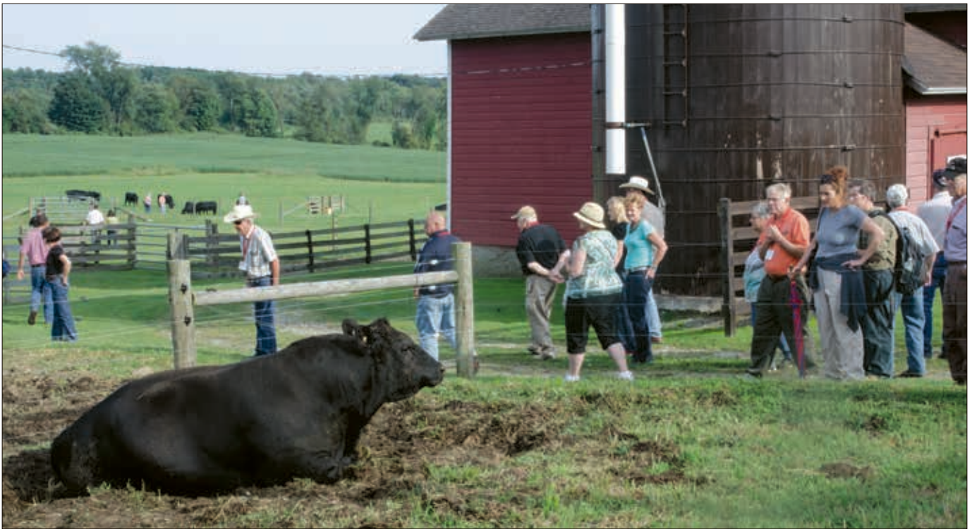
► Attendees wrapped up the tour at Rally Farms with its iconic red barns and plenty of green grass.