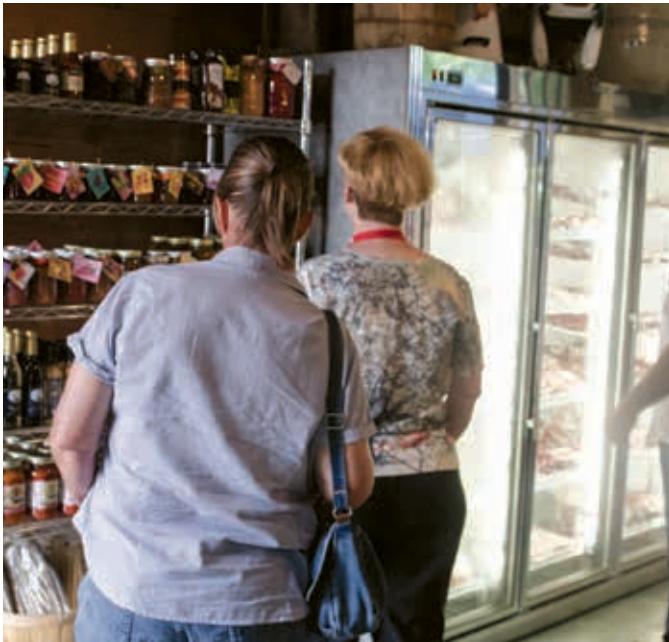
► Tour attendees learn how products are marketed at the Walbridge Market. Consumers like to see the farm near the market.