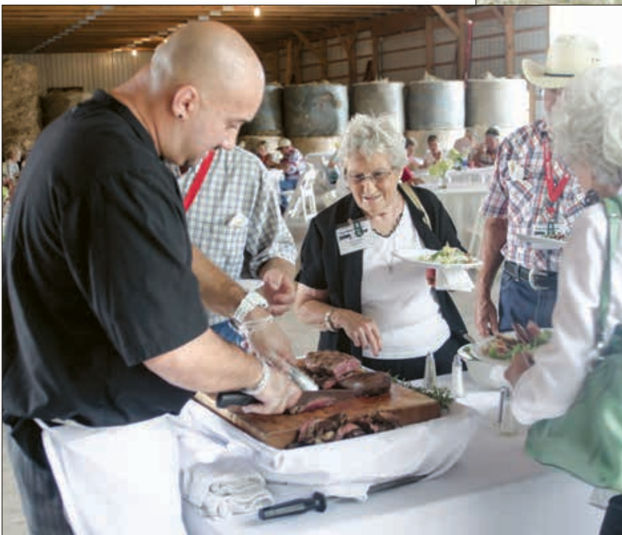
► Attendees enjoy a gourmet meal at Walbridge Farm and Market.