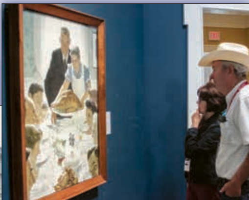
► Participants were able to view many of Norman Rockwell's original paintings and his studio at the Norman Rockwell Museum in Stockbridge, Mass.