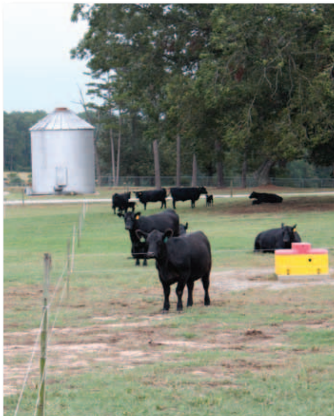
► Partisover Ranch is home to 270 Angus and SimAngus cows, and has a partnership herd in Oklahoma.