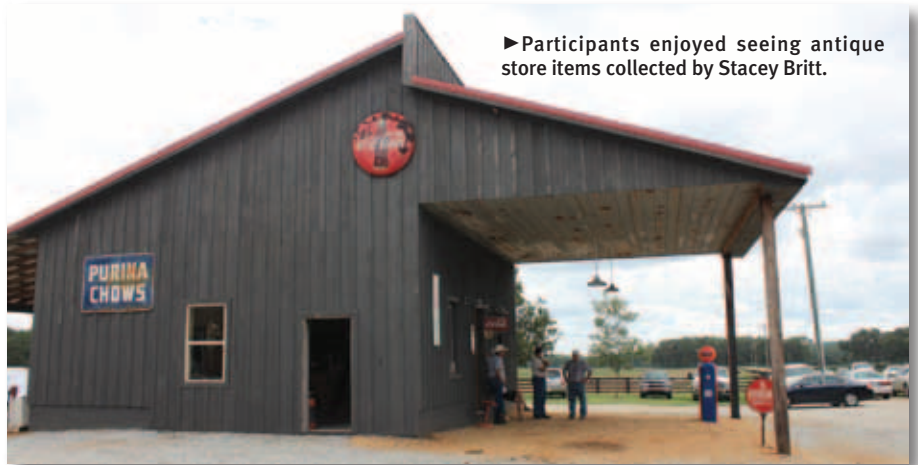
▶Participants enjoyed seeing antique store items collected by Stacey Britt.