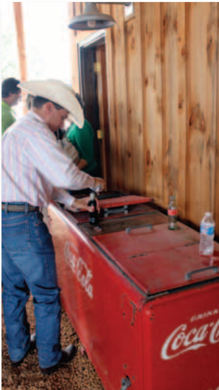
▶Above: Participants were treated to old-fashioned Coca-Cola® in a bottle at Britt Angus.

Editor’s Note: Through the sponsorship of Land O’Lakes Purina Feeds, Angus Productions Inc. provides comprehensive coverage of the NAC&T online at www.nationalangusconference.com . Visit the site for more in-depth summaries, PowerPoints and audio.