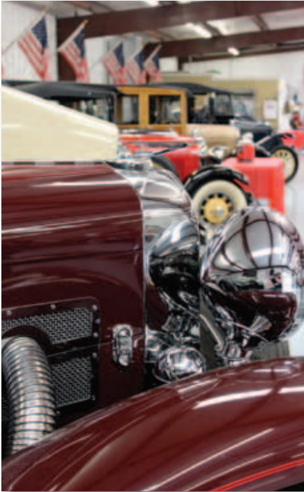
►Classic cars, a hobby of S. Truett Cathy, were in full display at Acres Away.