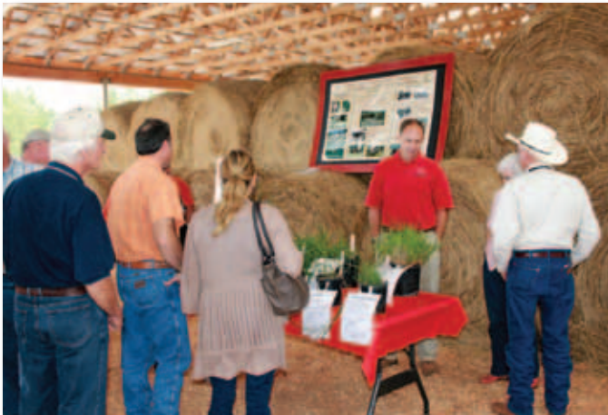
► Participants examine examples of southeastern roughage at UGA’s Double Bridges Farm.

Planning needs to take place early, Lacy advised, because poor planning can put families in trouble. Recognizing that family