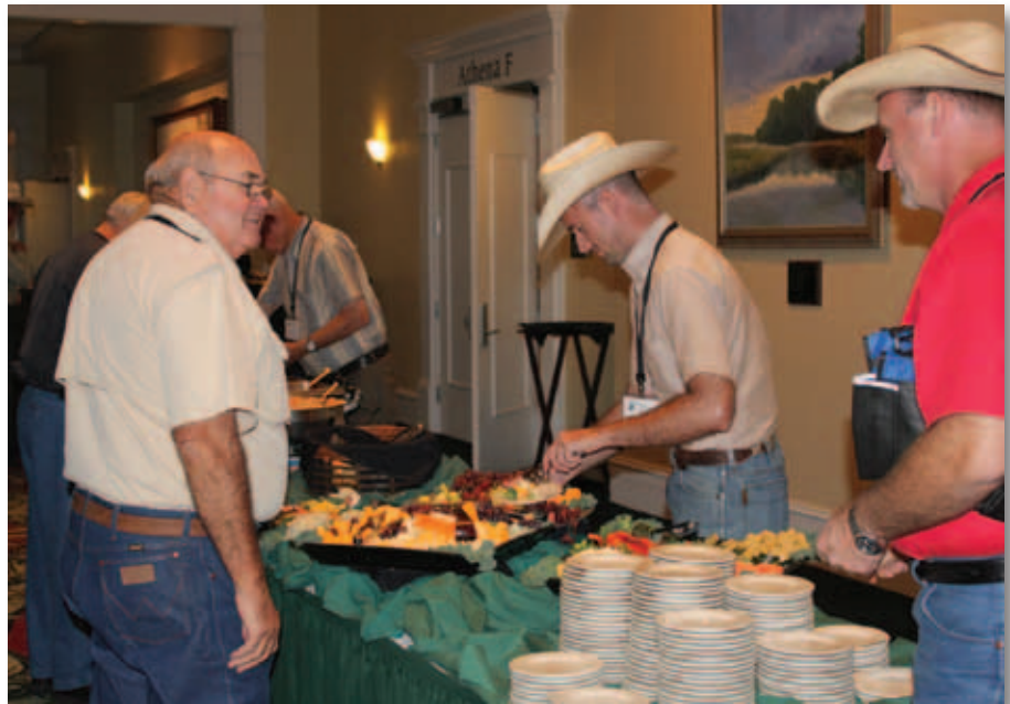
►Conference attendees enjoyed a welcome reception to kick off the conference.