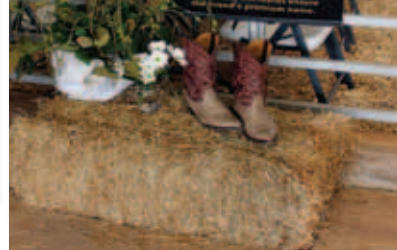
► Left: CAB sandwiches were served by members of the Georgia Angus Association and the Georgia Angus Auxiliary at Partisover Ranch.