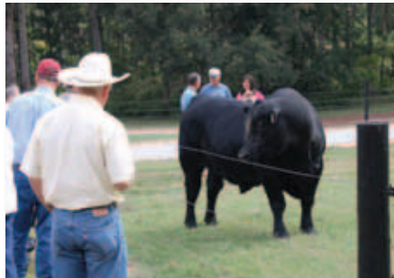
►Bramblett bulls are sold to commercial cattle operators.