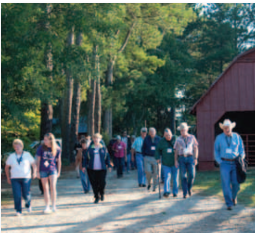
► Participants enjoyed the sunshine at Wakefield Farm.