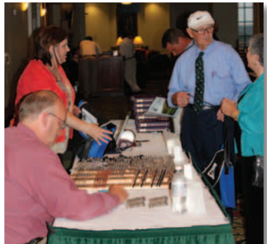
►After braving a tornado warning in the basement, participants received their registration materials and goody bags.