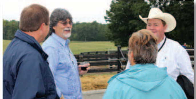
► Randy Owen, of the band Alabama, mingled with conference participants at Kensington Farm.