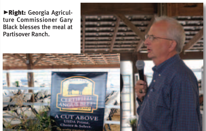
► Right: Georgia Agriculture Commissioner Gary Black blesses the meal at Partisover Ranch.