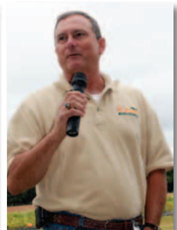
►The CEO of Lane Southern Orchards told participants that the orchards produce 1,000 pounds of pecans per acre.