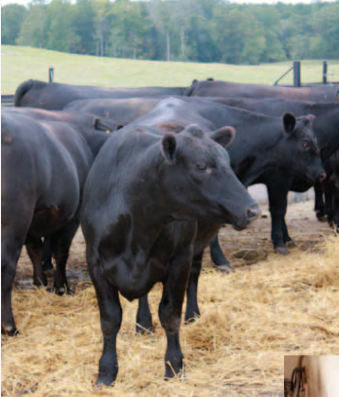
► Kensington Farm is home to 300 head of registered Angus cows, 50 embryo transfer calves, plus 100 Angus bulls from cooperator herds. Kensington Farm is one of Georgia’s oldest family-owned and -operated farms.