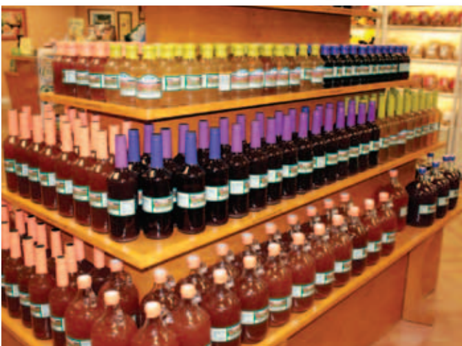
►Lane Southern Orchards' store offered participants many ways to enjoy peaches and pecans.