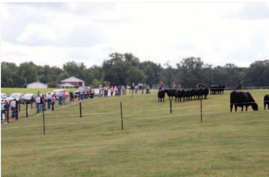
►Participants tour the Bramblett ranch.