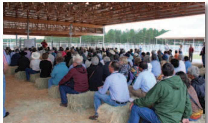
► Below: Participants learn how UGA’s Double Bridges Farm was developed to replace lands lost in campus extension.