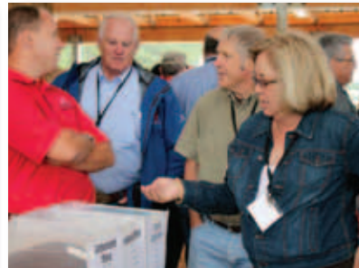
► Left: Conference participants were able to engage other senses when inspecting various southeastern feedstuffs at UGA’s Double Bridges Farm.