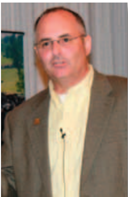
►International markets hold promise, but the beef industry needs greater access, emphasized CAB's Geof Bednar.