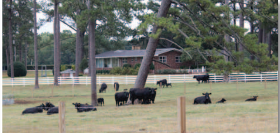
►Angus pasture next to Cathy's childhood home. The founder of Chick-fil-A still lives in that house.