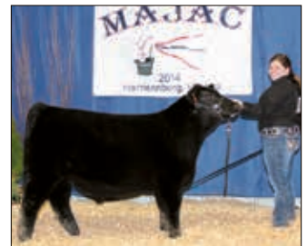
► Reserve intermediate champion, GGSC Cash 9A , by Clarke.