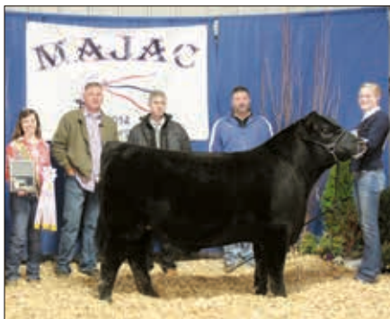
► Reserve grand champion B&O bull, MC SCC Confidence J3046.