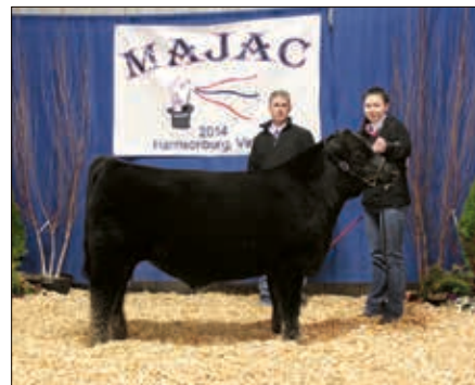
► Reserve champion onstage steer, Turning Pt. Duke 3127.