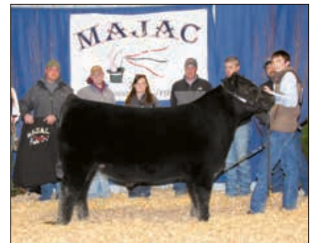
► Grand champion owned steer, Buchanan's Friday R269.