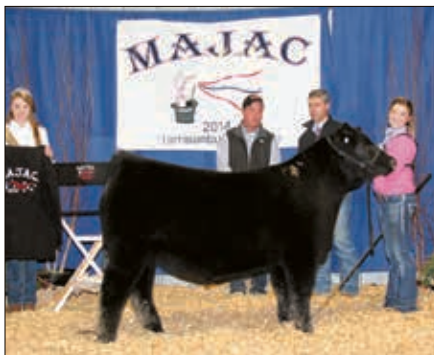
► Reserve grand champion owned steer, SCC FCF Doubledown 341.