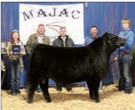
► Grand champion B&O bull, SCC First Choice 326.