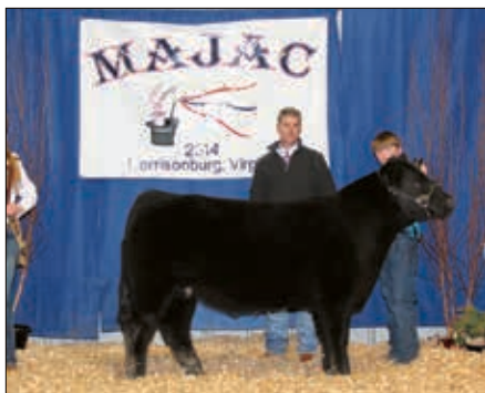
► Champion onstage steer, Silverado Lancelot 3335.