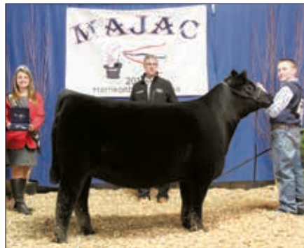
► Grand champion owned female, DDA Barbara 1308.