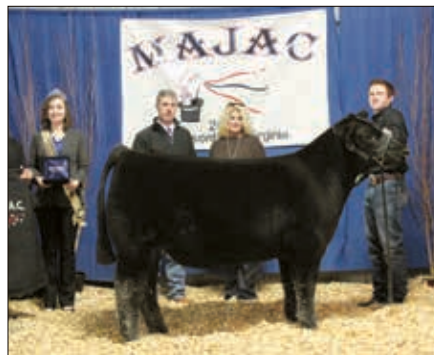
► Grand champion B&O steer, Cherry Knoll Gunner 1338.