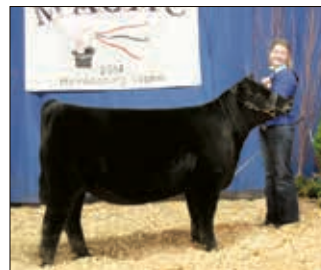
► Intermediate champion, SCC FCF Sweet Nellie 352 , by Crowe.