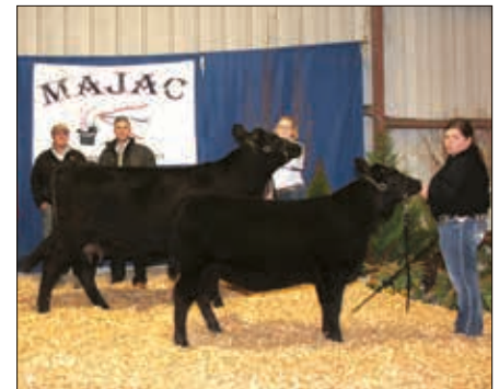
► Grand champion cow-calf pair, Windy Ridge Shadoc 11.