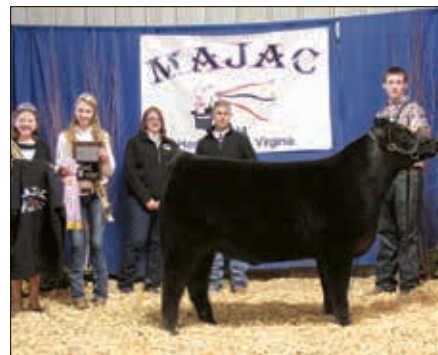
► Reserve grand champion B&O steer, Turning Pt. Grizzly 3157.