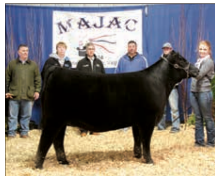
► Reserve grand champion owned female, SCC Highland Farms Lady 317.