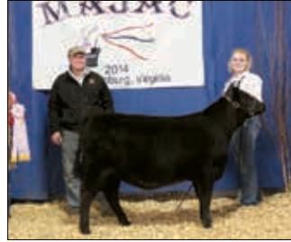
► Reserve senior calf champion, Hunter Ridge Shadoe 13 , by Schur.