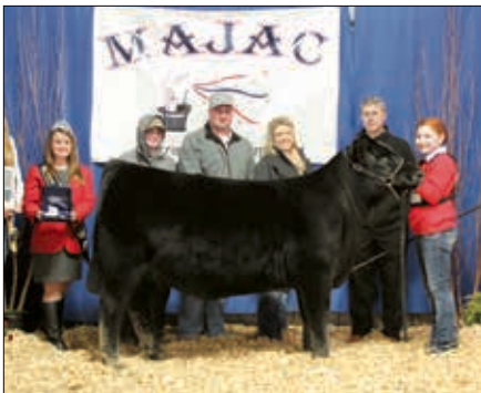
► Grand champion B&O female, Wright CKF Elsa 1301.