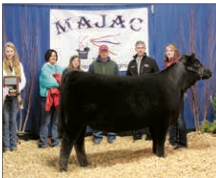
► Reserve grand champion B&O female, Gamble's Elbrea 2023.