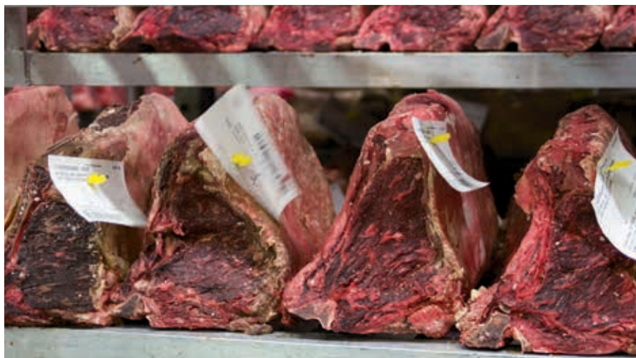
► Meats by Linz specializes in fabrication and custom aging, both wet and dry.

Meats by Linz has grown into one of the country's premier meat purveyors, supplying meat to some of the top steak houses, country clubs, casinos and hotels across the country.