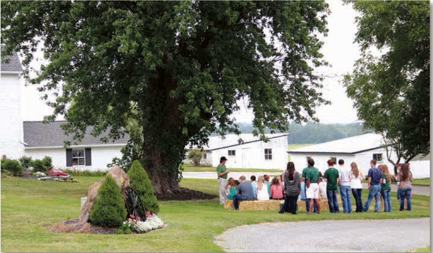
► A picture-perfect setting at Herr Angus Farm showcases all the best of Pennsylvania agriculture – green pastures, cool temperatures and a hint of rain.