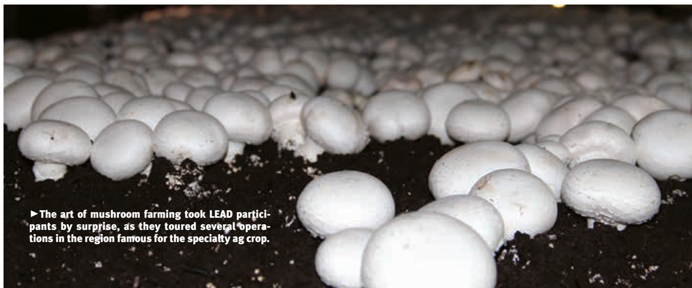
► The art of mushroom farming took LEAD participants by surprise, as they toured several operations in the region famous for the specialty ag crop.