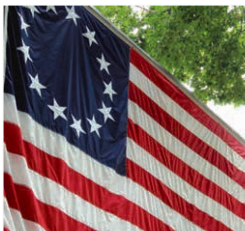
► Red, white and blue near Betsy Ross’s home in downtown Philadelphia. Angus juniors spent an afternoon exploring Philly and the history it holds.