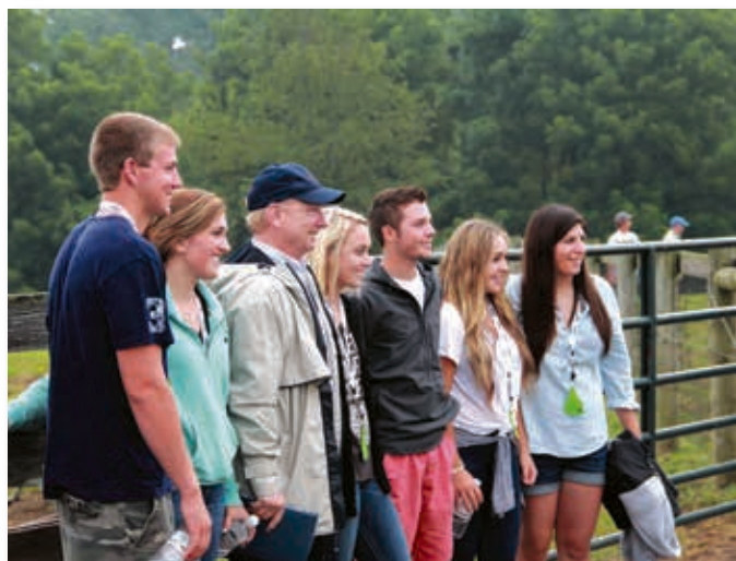
►A conference highlight for many was visiting Cherry Knoll Farm and viewing elite genetics while walking through a group of calves in the pens.