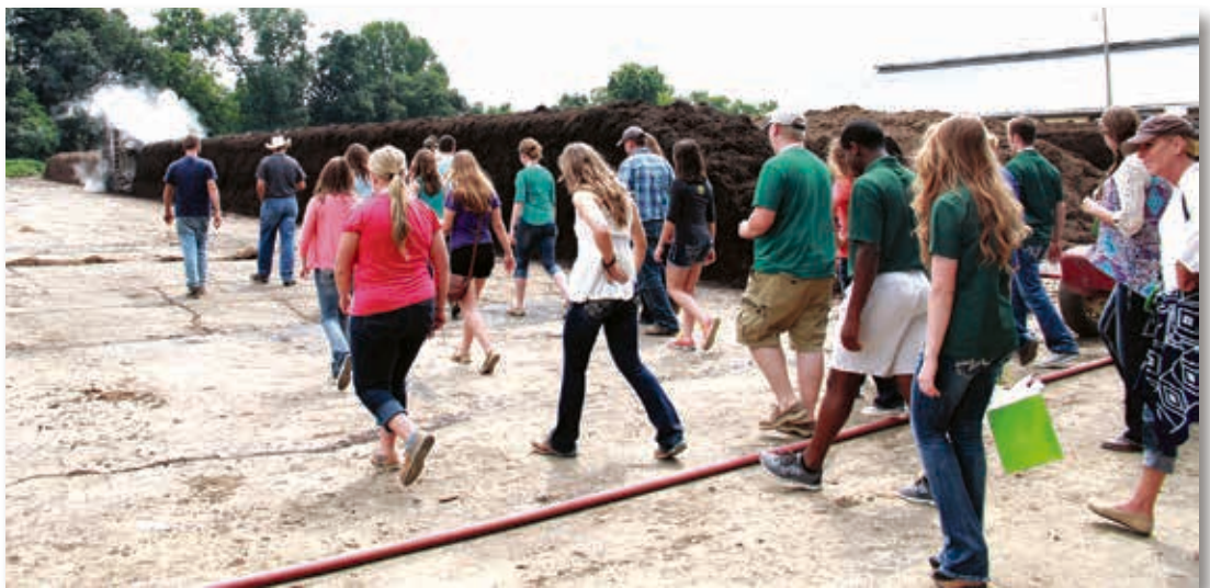
► Right: NJAA members tour a mushroom farm in Kennett County, Pa., an area that supplies more than half of the nation’s fresh mushrooms.