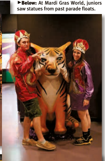
► Below: At Mardi Gras World, juniors saw statues from past parade floats.