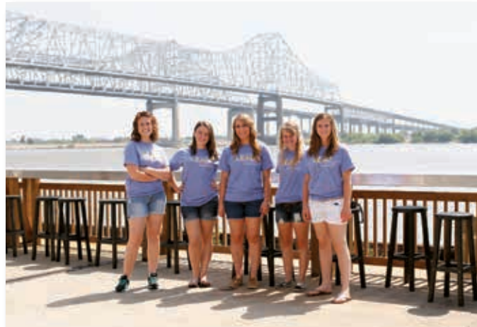
▶ LEAD attendees pose in front of the Mississippi River before touring Mardi Gras World.