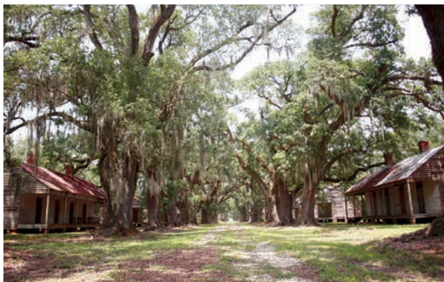
► Above: The Evergreen Plantation slave quarters still stand today, silently representing the nation's past.