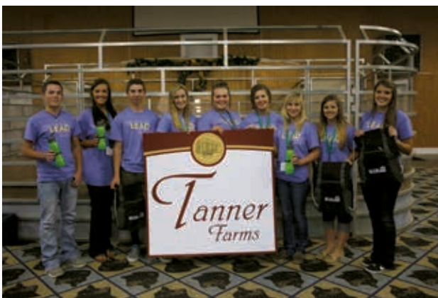
► Above: While at Tanner Farms, juniors learned the importance of cattle evaluation and participated in a cattle judging contest. The highest-scoring juniors received prizes from the NJAA.