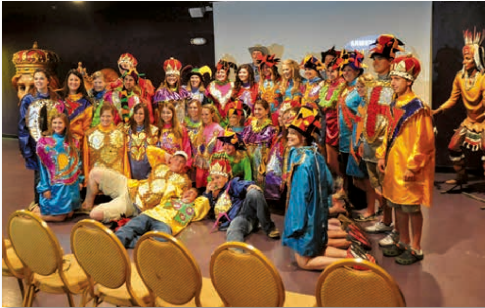
► LEAD members got a chance to try on Mardi Gras outfits, and learn about New Orleans history and tradition at Mardi Gras World.