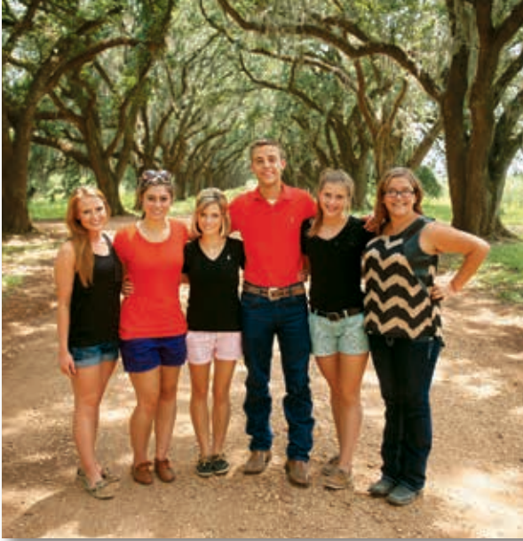
►A group of Angus juniors take a minute for a photo, after learning about Louisiana’s crops and horticulture at the plantation.