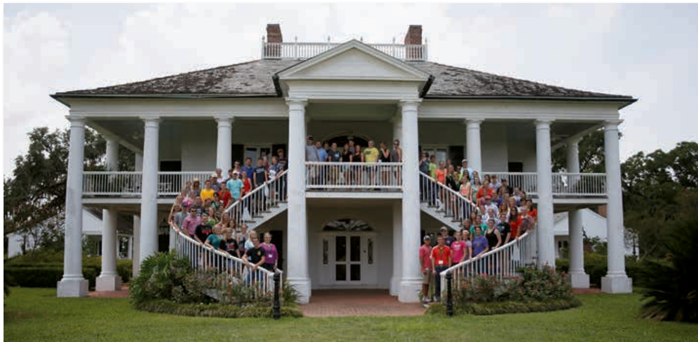
► LEAD attendees pose on the steps of the historical Evergreen plantation, where the popular movie Django Unchained was filmed.