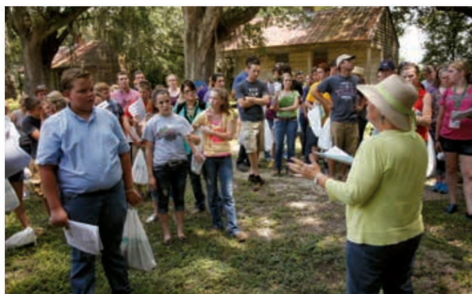
► Right: Juniors learn the economics of the Evergreen Plantation during the 1800s.