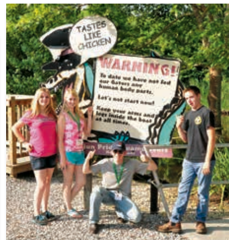
► Above: LEAD participants hit the swamp, where they saw wildlife firsthand and learned about what makes the area unique.