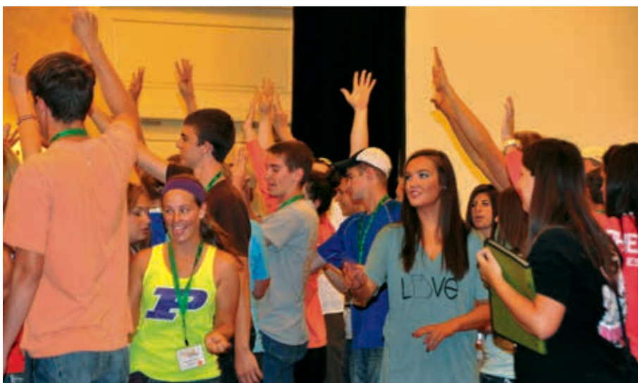
▶ Juniors participate in icebreakers after arriving in New Orleans, La.