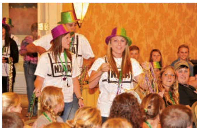
▶ The six new members of the National Junior Angus Board, elected in July, made their first appearance together at LEAD.