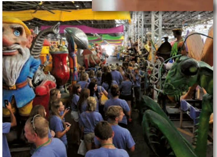
► Attendees also watched workers hand-carve the iconic characters at Mardi Gras World.