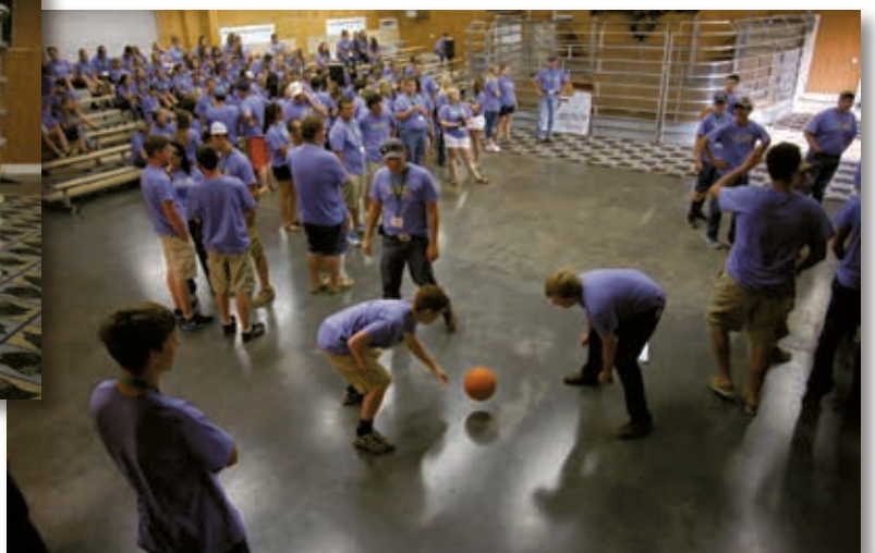
► Right: After an educational evening at Tanner Farms, juniors relaxed with games like basketball and volleyball.