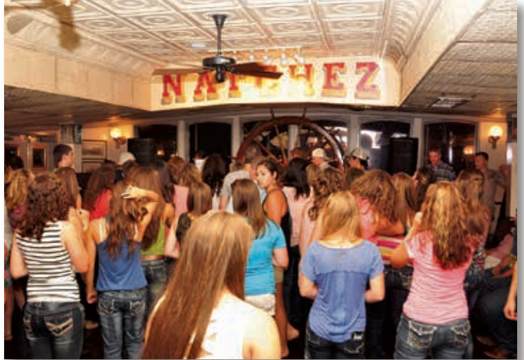
►The last night at LEAD included a ride down the Mississippi River on the historic Steamboat Natchez. There, juniors experienced Cajun food and danced the night away.