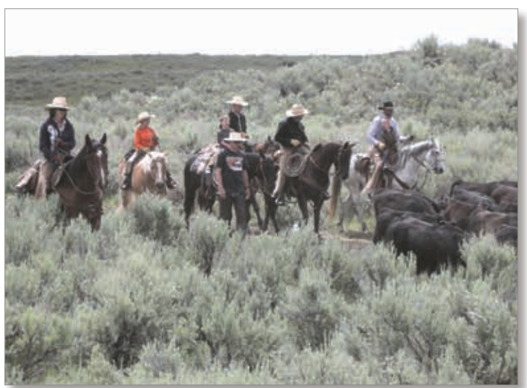
► "With proper training, children can easily recognize the warning signs from livestock. Parents should teach their children to watch livestock whenever they are within their presence," advises Yelton.

0-6 years old, a "designated safety zone" needs to be created. This should be located away from high-traffic areas and should be fenced well enough that a child cannot easily escape.