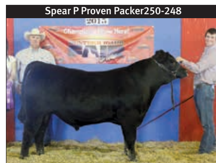
Spear P Proven Packer250-248