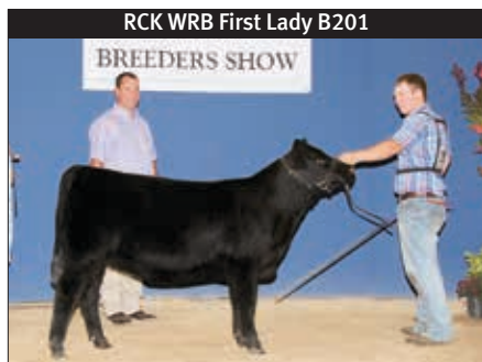
RCK WRB First Lady B201