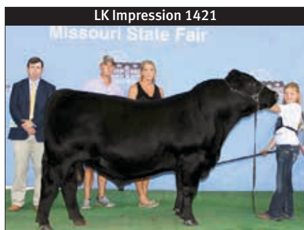
LK Impression 1421