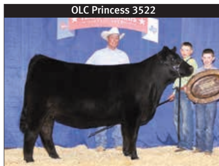
OLC Princess 3522