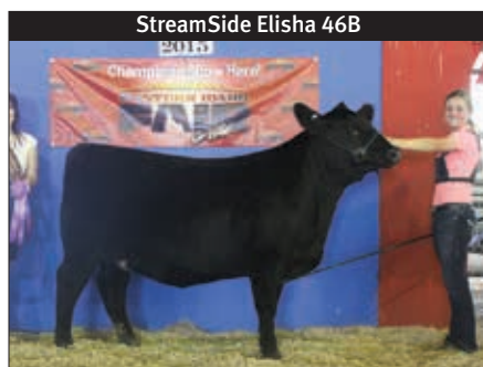
StreamSide Elisha 46B