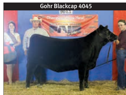
Gohr Blackcap 4045