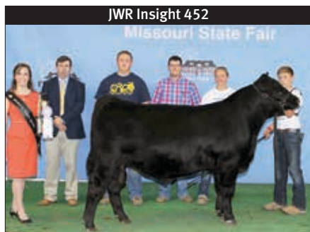
JWR Insight 452