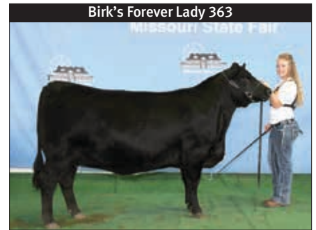
Birk's Forever Lady 363