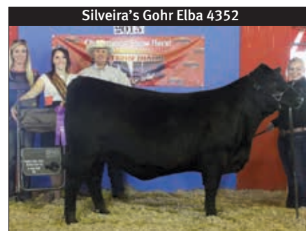
Silveira's Gohr Elba 4352