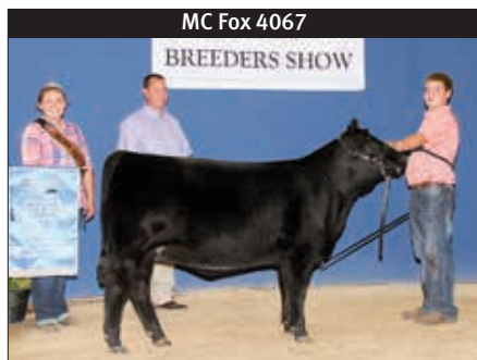
MC Fox 4067