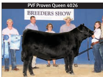
PVF Proven Queen 4026