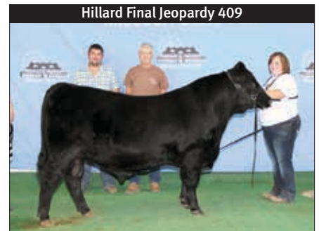
Hillard Final Jeopardy 409