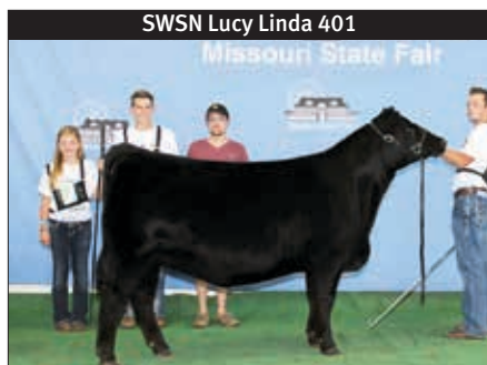
SWSN Lucy Linda 401