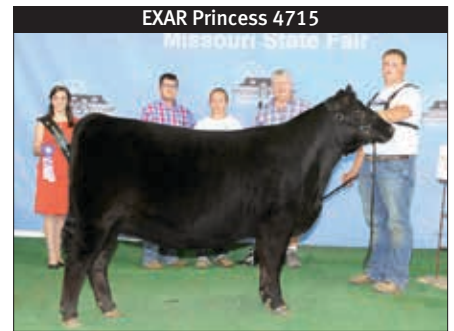
EXAR Princess 4715