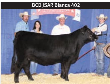
BCD JSAR Bianca 402