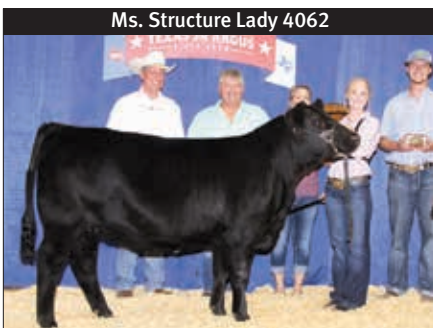
Ms. Structure Lady 4062