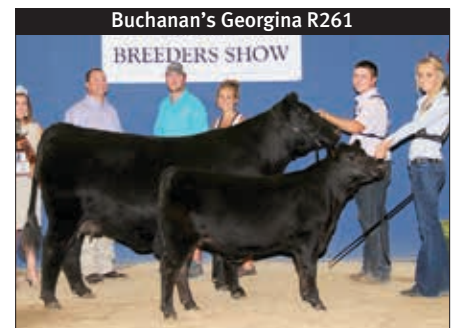
Buchanan's Georgina R261