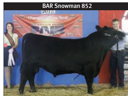
BAR Snowman 852