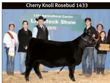
Cherry Knoll Rosebud 1433