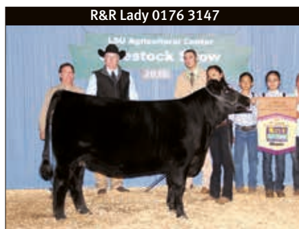
R&R Lady 0176 3147