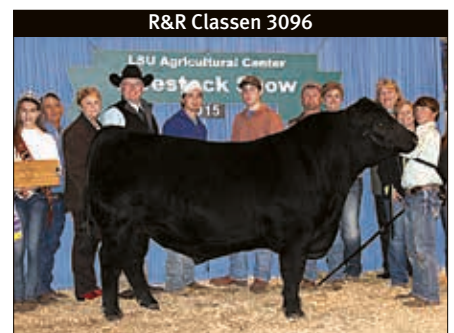
R&R Classen 3096