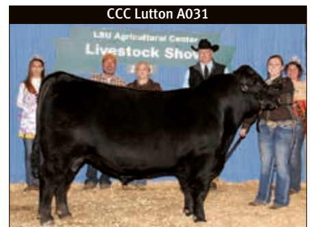
CCC Lutton A031