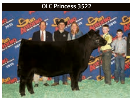
OLC Princess 3522