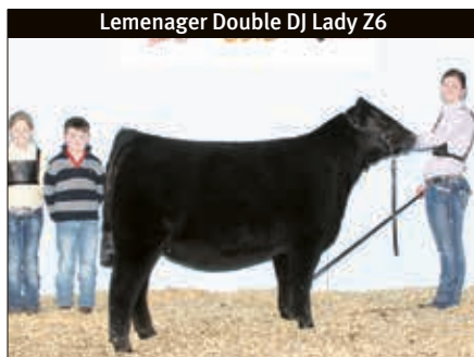
Lemenager Double DJ Lady Z6