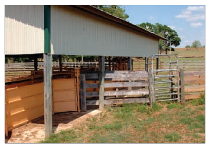
►With a gate off the loading chute, Joe Williams can cut cattle four ways.

His wife, Faye, adds, "If she needs an attitude adjustment, she gets in a trailer and goes to the sale barn. One with a bad attitude can upset a whole pen."