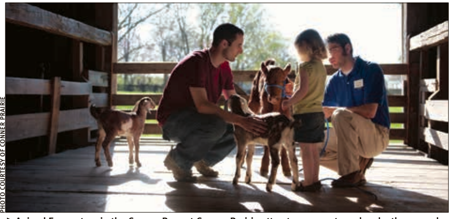
▶ Animal Encounters in the Conner Barn at Conner Prairie attract new guests and make them regular members. This barn has baby animals of different species from April through October.

The zoo offers several biomes, or collections of habitats. These include oceans, forests, plains, deserts, aviaries, the White River Gardens, and dolphin pavilion and marine mammals. The dolphin pavilion has a 30-foot (ft.)-diameter, 12-ft.-high underwater viewing dome in the center of the main performance pool — the first