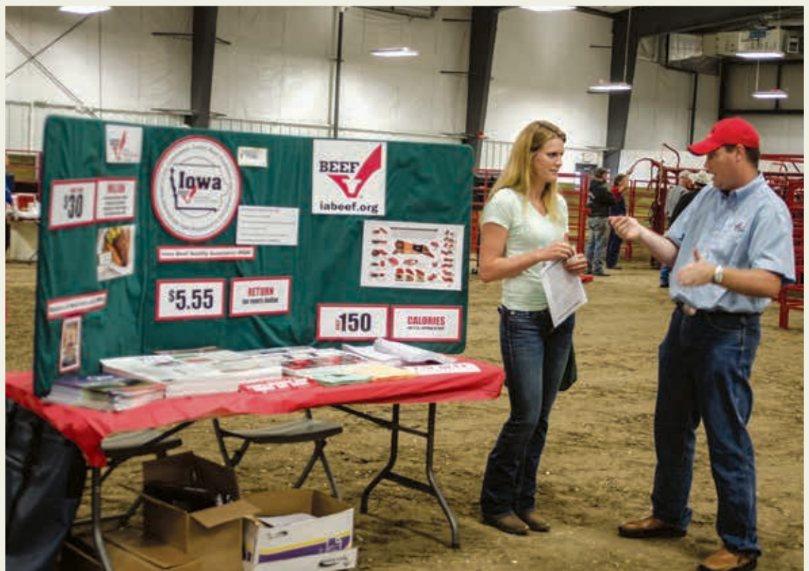
► Right: The Iowa Beef Industry Council provided literature on beef cattle welfare.