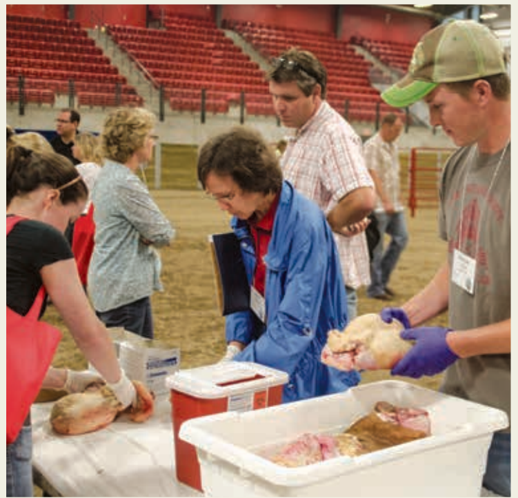
► Below: Attendees could dissect a scrotum to understand where to apply the local anesthetic.