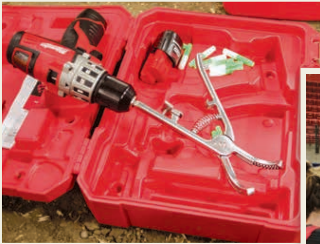
► Left: The Henderson castrator can be attached to a handheld drill and serves as a quick, bloodless castrator.