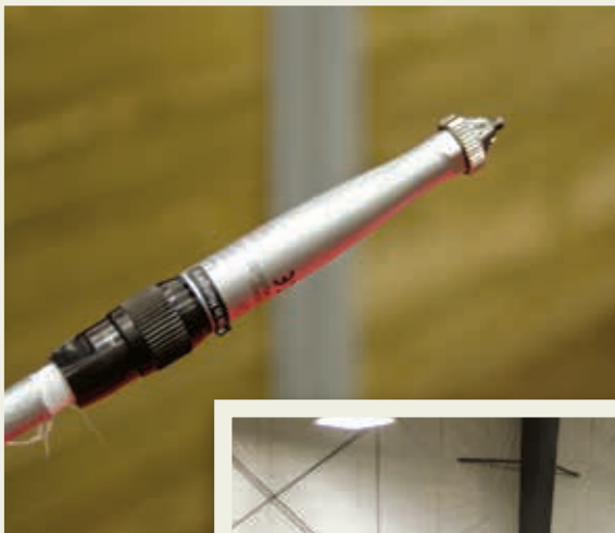
► Above: An air prod was available for test use instead of a hot prod. The prod emits a noise and the end vibrates instead of producing an electric shock.