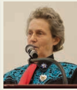
► Temple Grandin, professor of animal science at Colorado State University, said there are three types of welfare issues — abusive treatment in undercover videos, housing or procedures and, the biggest future issue, biological system overload.