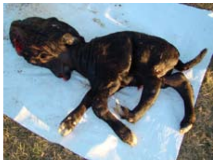
Fig. 2: Calf displaying hydrocephalus

Steffen says. “This allowed Dr. Beever and I to characterize the phenotype, identify the gene and to develop a test.”