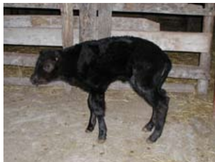
Fig. 4: Calf displaying characteristics of FCS