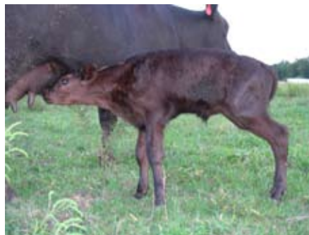
Fig. 3: Calf displaying characteristics of FCS

“In their first days of life, FCS calves are