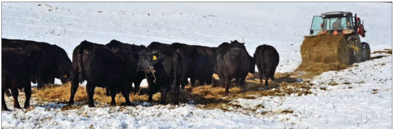
▶ According to Gerrish, for every 100 lb. of additional body weight, a cow must consume 500 lb. of additional forage per year to meet her maintenance requirement. The cost can be dear in more ways than one.