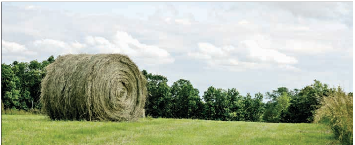
► In Gerrish’s experience, producers with relatively small operations, but a full line of haying equipment, often have true hay production costs that exceed $200 per ton. Producers may be able to reduce feed costs by purchasing hay.