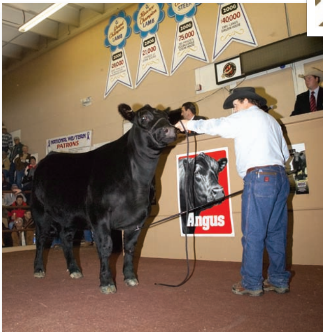
►Right: Riverbend Rita R125, due to calve to Mytty In Focus March 13, headlined the 2007 Angus Foundation Heifer Package, which also included 30 days of free insurance, free transportation to the buyer's ranch, and a flush and three embryo implants into the buyer's recipient cows.