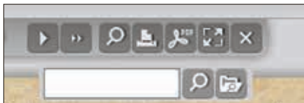
Fig. 9: Search function for digital Angus Journal

As our archive grows, that search feature (see Fig. 9) will be handy. You can search back issues for feature stories in the Angus Journal from 1979 forward using our back-issue search at www.angusjournal.com . We'll maintain that search function as we have in the past, at least for now. The search of the digital archive will allow you to search both editorial and advertising — and within one issue or across all issues in the digital archive, which goes back to the October 2012 issue.