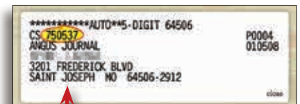
Fig. 1A (right): Location of customer code on Angus Journal label