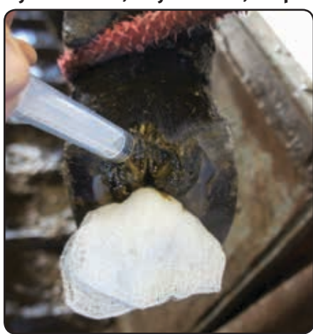
Apply 2cc of LA200 or similar medication.