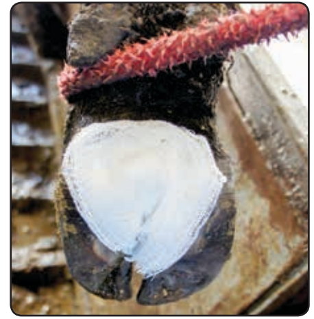
Cover lesion with a diaper-like bandage.