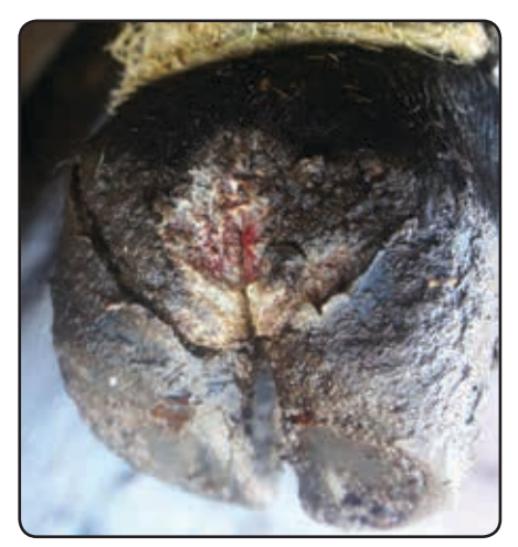
► An example of digital dermatitis in the M2 stage. If they are unfamiliar with the term "digital dermatitis," some cattle folk may have heard the condition referred to as strawberry foot, raspberry heel or, most commonly, hairy heel warts. They really aren't warts, but the disease results in ulcerative lesions, the appearance of which has been likened to warts.

The etiology of digital dermatitis is not clearly understood. Dopfer says Treponema -like organisms, and perhaps more than one species of these spiral-shaped bacteria, are