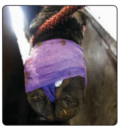
This bikini-wrap is complete.