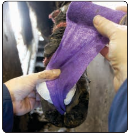
Wrap through front and backside.