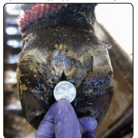
The M2 dermatitis is the size of a quarter.