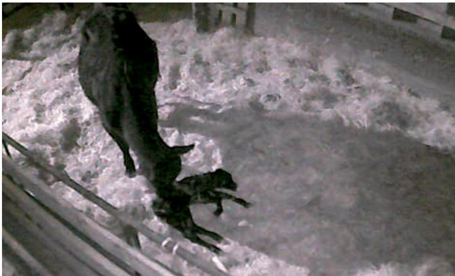
► Experienced producers generally agree that on-camera monitoring of calving helps eliminate the need for repeated trips to check on the progress of heifers or cows in labor.

Delaney credits wireless technology for greatly broadening the application of monitoring and surveillance cameras. In many situations, video feeds can be viewed from computers, electronic tablets and smartphones. The video can be watched on any Internet-capable device, in any location where an Internet connection is available.