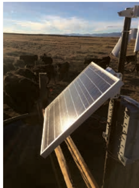
► A camera mounted on a post near a stock tank sent a video feed by directional antenna to an omnidirectional antenna located at the rented ranch’s building site. From that “hub,” video images were transmitted to Rodney Becker’s home ranch.

Users can also remotely control motorized pan-and-tilt cameras.