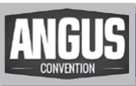
Table of Contents for 2016 Angus Convention Coverage