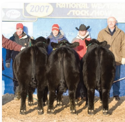
▶Reserve early calf champion pen, by Quirk Land & Cattle Co. , Hastings, Neb.