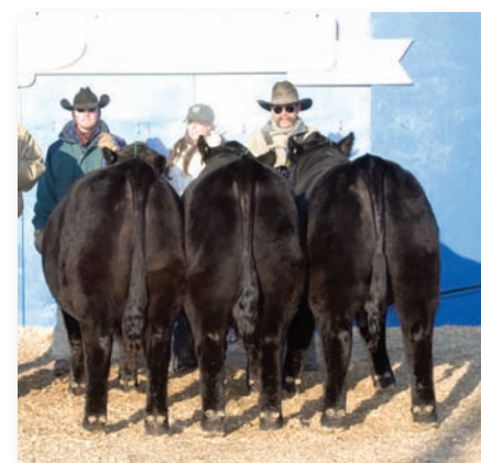
▶Reserve champion yearling pen, by Rock'n R Angus Ranch , Plainville, Kan.