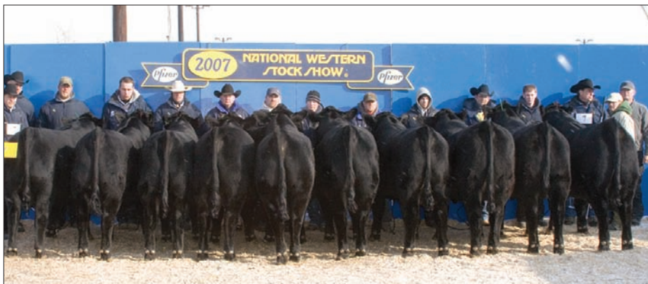
► Reserve grand champion carload, by Express Angus Ranches , Yukon, Okla.