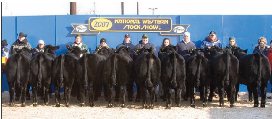
► Grand champion carload, by Whitestone-Krebs , Gordon, Neb.