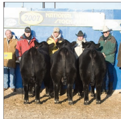
► Reserve grand champion pen, by Rolling RRR Ranch LLC , Edmond, Okla.