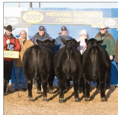
► Grand champion pen, by Rolling RRR Ranch LLC , Edmond, Okla.