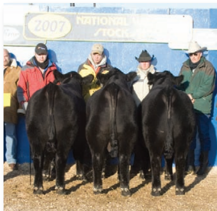
▶Late calf champion pen, by Rolling RRR Ranch LLC , Edmond, Okla.