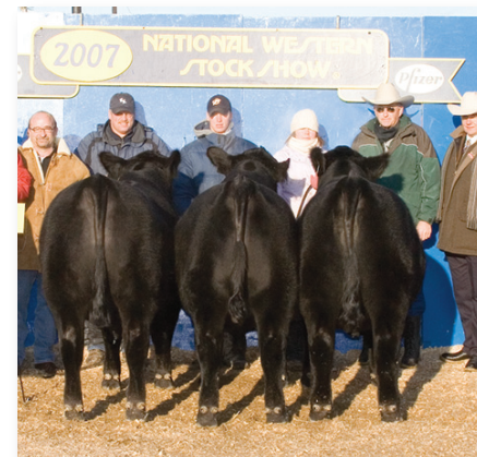
▶Early calf champion pen, by Rolling RRR Ranch LLC , Edmond, Okla.