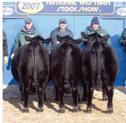
▶Reserve late calf champion pen, by Limestone LLC , Perkins, Okla.