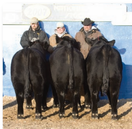
▶Champion yearling pen, by Pollard Farms LLC , Enid, Okla.