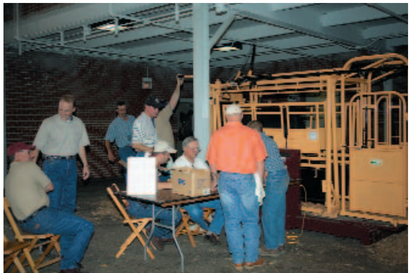
► Regional managers and Association staff help check in steers, among a host of other assignments, while at the 2006 NJAS.