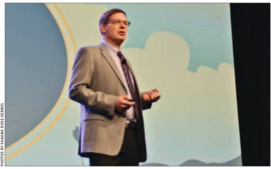
► "The cow-calf margins will still be profitable, but substantially lower than in the past two years," said Kevin Good, senior analyst and fed-cattle market specialist, CattleFax.

As a result of the strong supply, West Texas Intermediate (WTI) crude oil averaged $49.96 per barrel in 2015, a 48% price decline from the previous year. A range from $25 to