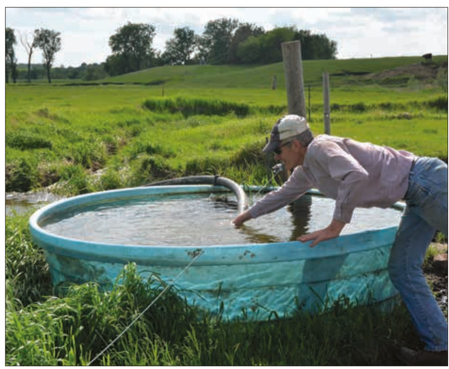
► Wright eliminated foot rot and generally improved health by fencing cattle away from the creek and developing water access points.

As a guiding principle for developing great cows, perhaps that's the Wright stuff.