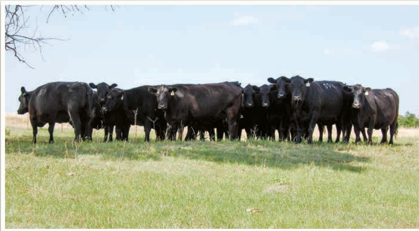
► On the edge of severe drought for years, this summer saw relief in June and July, promising better days ahead.