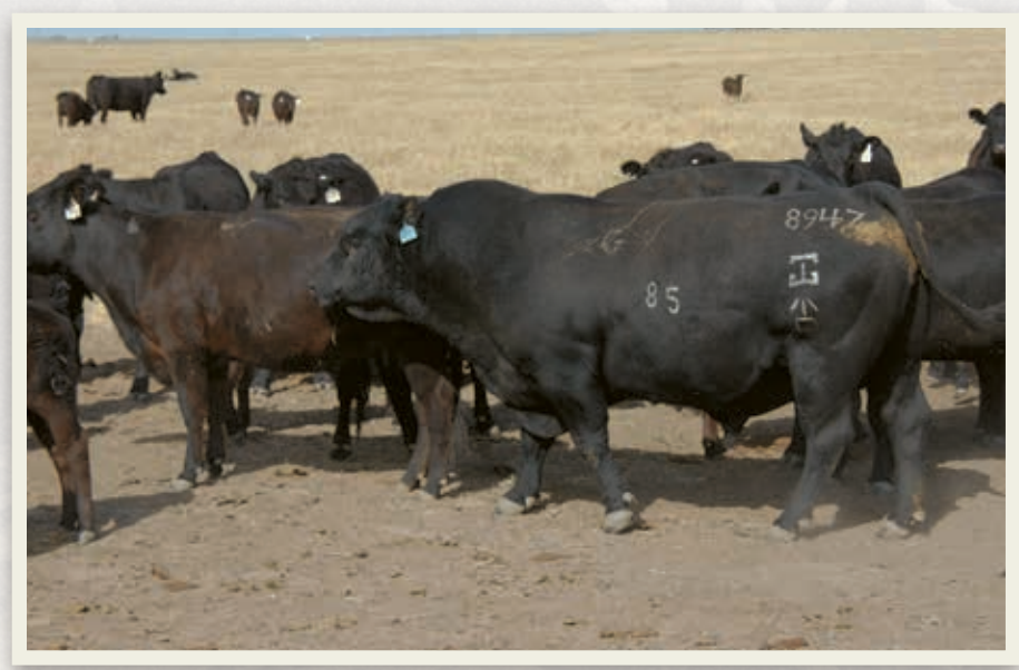
► One 5-year-old bull used as a cleanup bull this year is backed by three years of data — from birth weights to carcass merit. That's especially important for a herd focused on rebuilding.