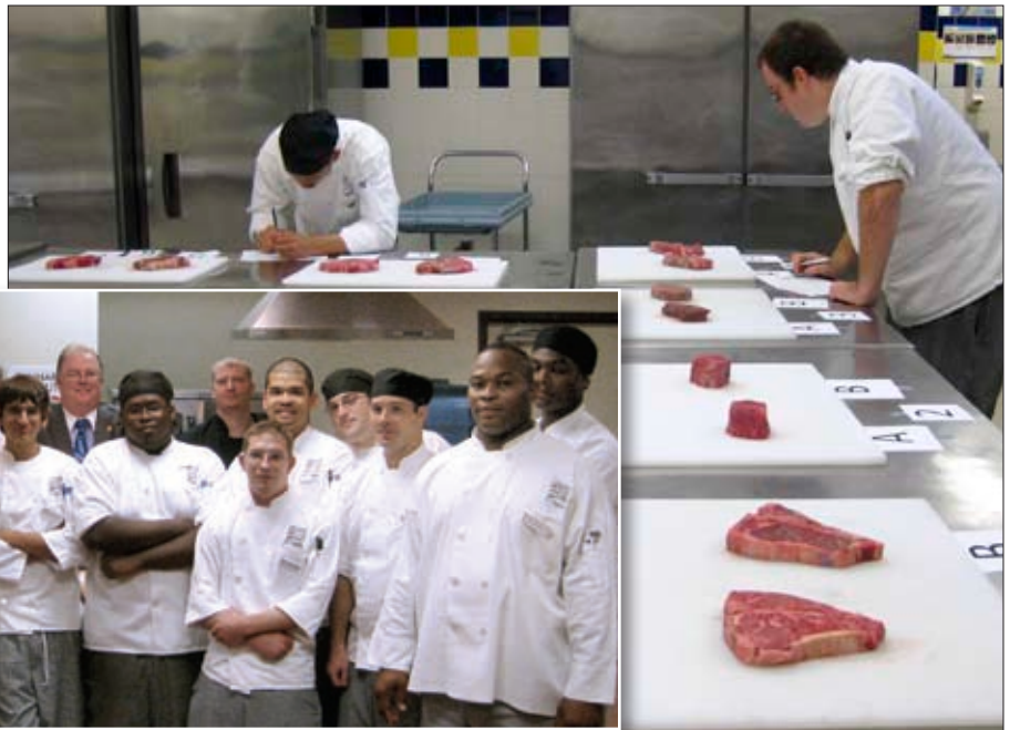
► Nine two-person teams participated in a scholarship competition sponsored by PFG Foodservice of Virginia and CAB at the Culinary Institute of Virginia. Competitors also had to identify 10 cuts of beef and determine between CAB and USDA Select-grade beef.

It's not easy to sell beef by the portion to a chef who only wants to talk cost per pound. In the quest to assist brand partners as much