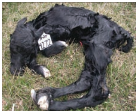
►Curly Calf Syndrome: Note contracted or extended limbs, curved spine and “thin” appearance of curly calves.