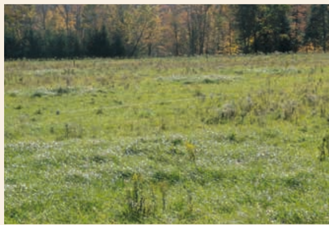
► This picture depicts fall regrowth where round bales were fed the previous winter. Research has shown bale grazing can add 548 lb. of nitrogen and 49 lb. of phosphorus per acre.

Lindquist says. "The cows have direct access to the bales. Hay losses can approach 25%-40% in this method of feeding, depending on environmental factors. These farms reduce this loss by making the cows clean up more of the trampled hay before