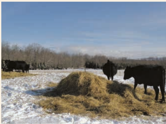
► Above: Cattle at Angus Glen Farms are shown after one day of bale grazing round bales.

Plenty of adjustments can be made for bale grazing in less-than-optimal conditions, Chedzoy says. If soil conditions get soggy, pull the cattle off and turn them back out