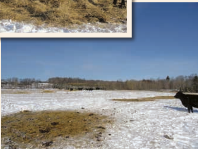
► Right: This picture shows hay wastage after two days of bale grazing.