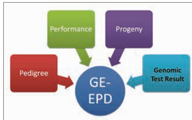
Table 1: Establishing direction of percent ranks