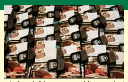
► At the end of the program, participants received steak seasoning and one lucky person won a CAB Gifts that Sizzle holiday package.

► Right: Scenarios were passed out to several groups who had to review an animal's harvest statistics and decide if the animal qualified for CAB.