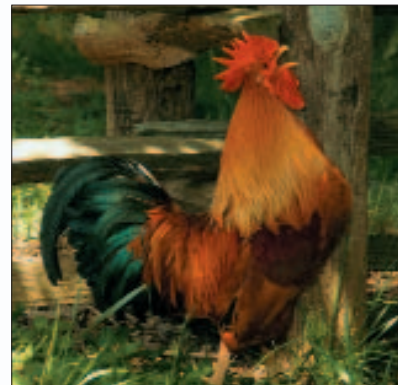
AROUND THE FARM OR RANCH