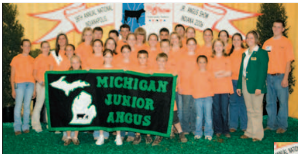
►Left: The Michigan Junior Angus Ass'n won first place in herdsmanship with 31-45 head of cattle.