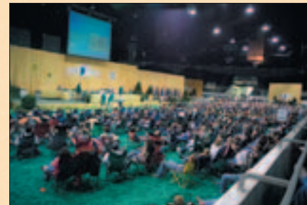
► Juniors filled the ring of Pepsi Coliseum during the Awards Ceremony Friday night.

The purpose of this competition is to encourage cooperation, fellowship and teamwork among state juniors in developing and maintaining a display of cattle and stall area. It also promotes pride and enthusiasm for the state junior organization and rewards those organizations that achieve this purpose. Divisions are based on the number of cattle exhibited by the states — 46 head or more, 31-45 head, 16-30 head and 15 or fewer head. Judging is based on cleanliness and general appearance of the aisle and bedding; appearance of the animals; appearance and organization of equipment and signs; youth tending the cattle; and promotion of state, association, Angus or beef. Each placing state junior Angus association will receive the following premiums: first, $125; second, $100; third, $75; fourth, $50; and fifth, $25.