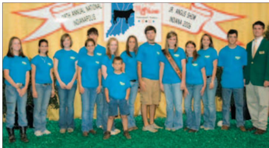
►The Georgia Junior Angus Ass'n won first place in herdsmanship with 16-30 head of cattle.