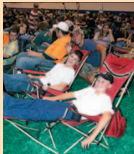
►Juniors bring their folding chairs to the Pepsi Coliseum for Friday evening's Award Ceremony.

The American Angus Auxiliary sponsors the Janet Castle Crystal Award to promote and encourage participation in educational events. These contests allow all juniors, even those who might not show cattle, to participate in the NJAS. Points are earned for placing and participation in the following contests: photography, poster, graphic design, extemporaneous and public speaking, team sales, creative writing, quiz bowl, and the Auxiliary-sponsored All-American Certified Angus Beef® Cook-Off. Two awards are presented, one to the high-point boy and one to the high-point girl.