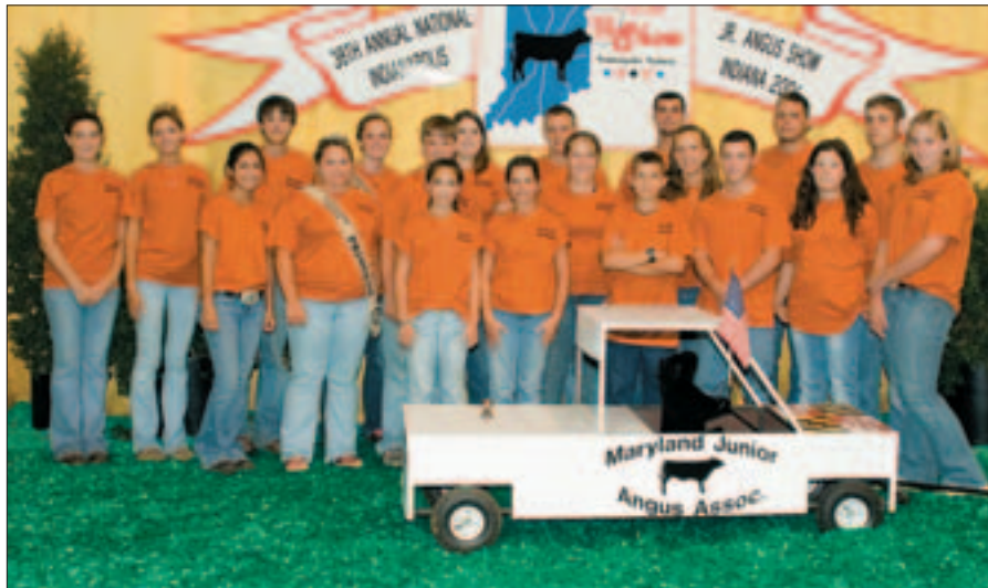
► Winning second in the scrapbook contest is the Maryland Junior Angus Ass'n.