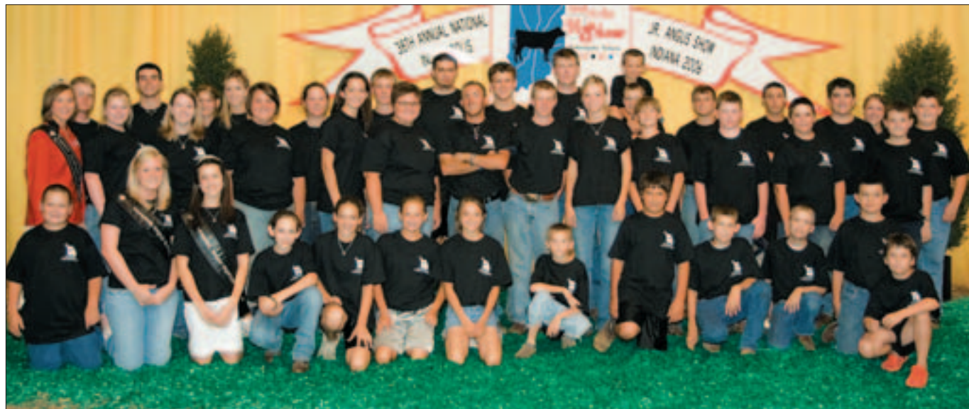
►The Missouri Juniors Angus Ass'n won first place in herdsmanship for 46 or more head of cattle.