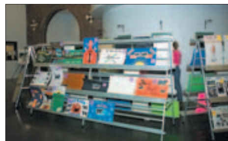
►Right: Poster entries were on display throughout the week near the show office.