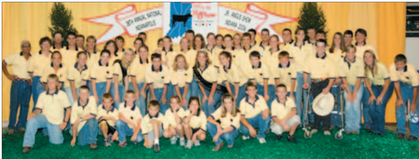
► Winning third in the scrapbook contest is the Kansas Junior Angus Ass'n.