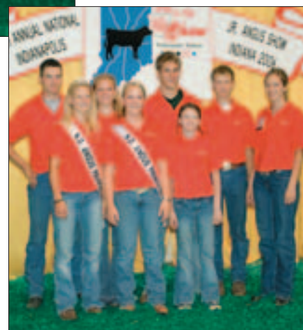
►Below: The North Dakota Junior Angus Ass'n won first place in herdsmanship with 15 or fewer head.