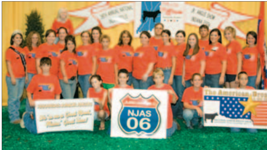
► Winning first place in the scrapbook contest is the Arkansas Junior Angus Ass'n.