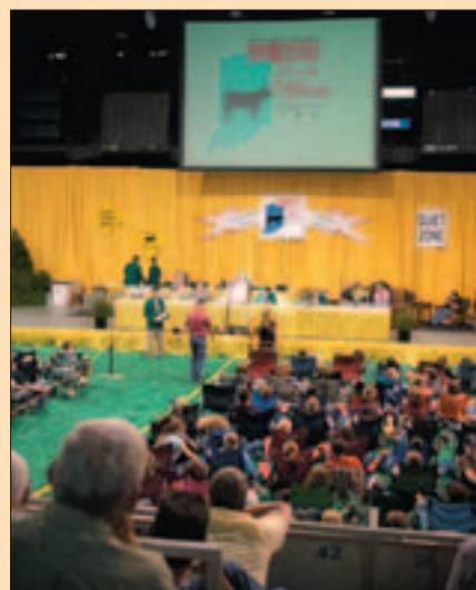
►One by one, juniors approach the podium to be recognized for accomplishments and collect awards.

Through generous endowments to the Angus Foundation, Angus enthusiasts have created scholarships that, for years to come, will empower NJAA members to attend college and pursue studies in their respective career fields.