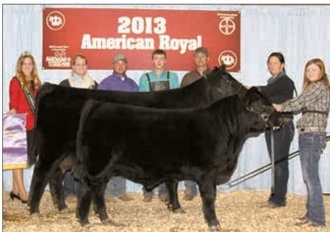
▶ Grand champion cow-calf pair, Cherry Knoll Elisha 1146.