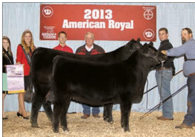
▶ Reserve grand champion cow-calf pair, QVS Georgina 2031.