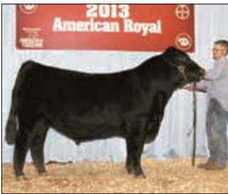
► Intermediate champion bull, BC II Skyfall 2812 , by Express Angus Ranches; BC XII Farm, Sheridan, Ind.; and JS Cattle Venture, Niota, Ill.