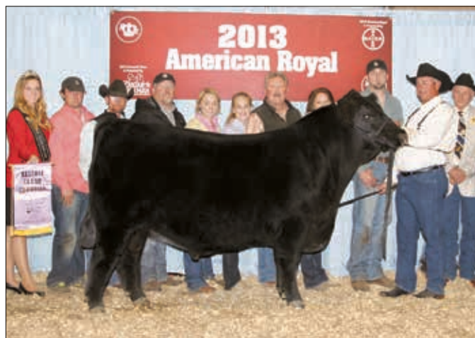
▶ Reserve grand champion bull, Silveira's S Sis GQ 2353.