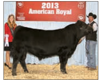
► Reserve senior calf champion, Wallace Challenger 280 , by Wallace Cattle Co, Stotts City, Mo.; and Carriers Muddy Creek Angus Farm, Lockwood, Mo.