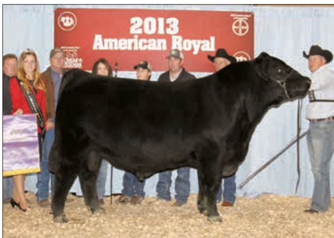
▶ Grand champion bull, EXAR Blue Chip 1877B.