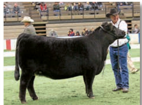
► Exhibitors led 128 heifers in the open female division of the Super-Point ROV Angus Show at the American Royal.