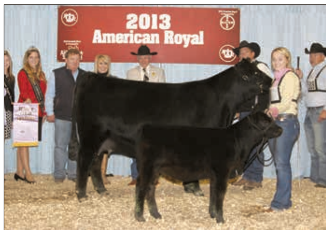
▶ Reserve grand champion female, EXAR Winnie 5291.