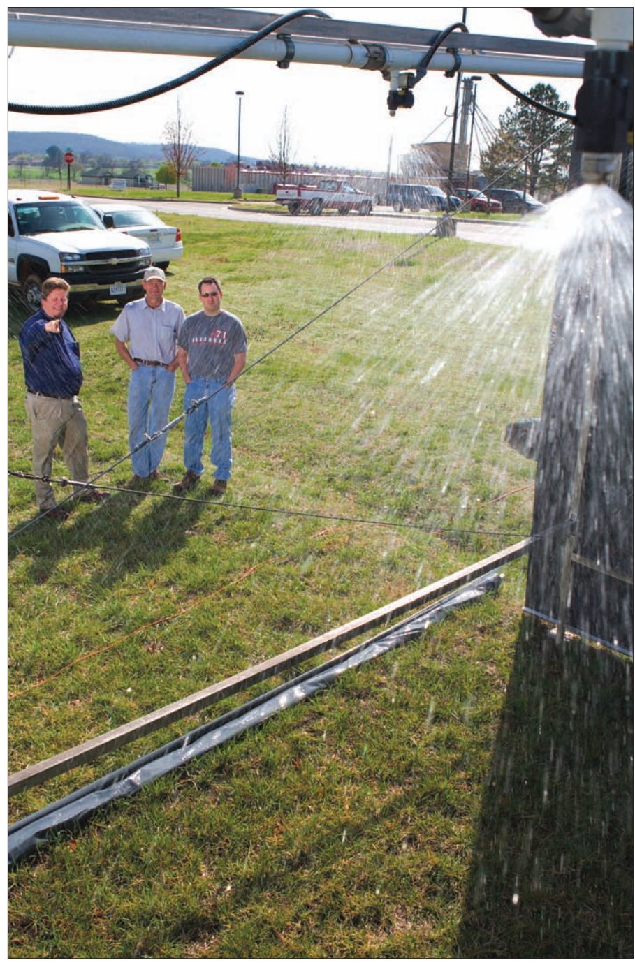
► ARS and University of Arkansas scientists conduct a rainfall simulation to determine the long-term effect of alum-treated poultry litter on aluminum and phosphorus runoff.

In previous studies by Moore and colleagues, alum-treated litter reduced runoff