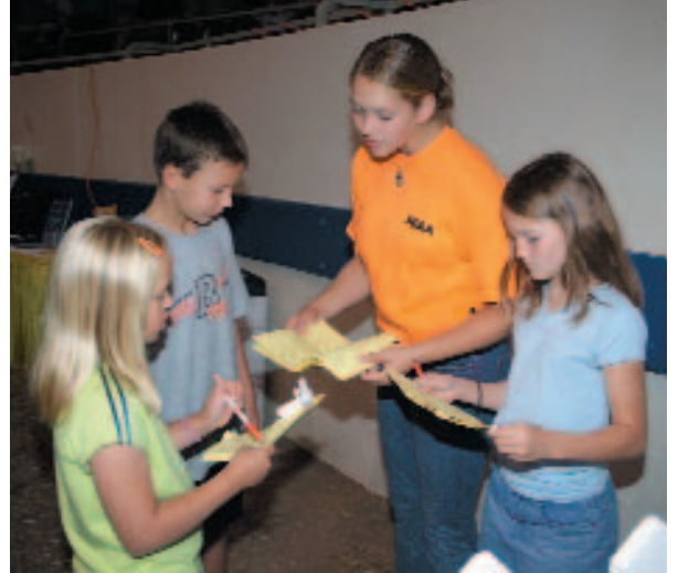
►Right: Older NJAA members could be seen throughout the week helping those new to the NJAS meet other juniors, learn about the events and add signatures to their autograph booklets for the Mentoring Program.