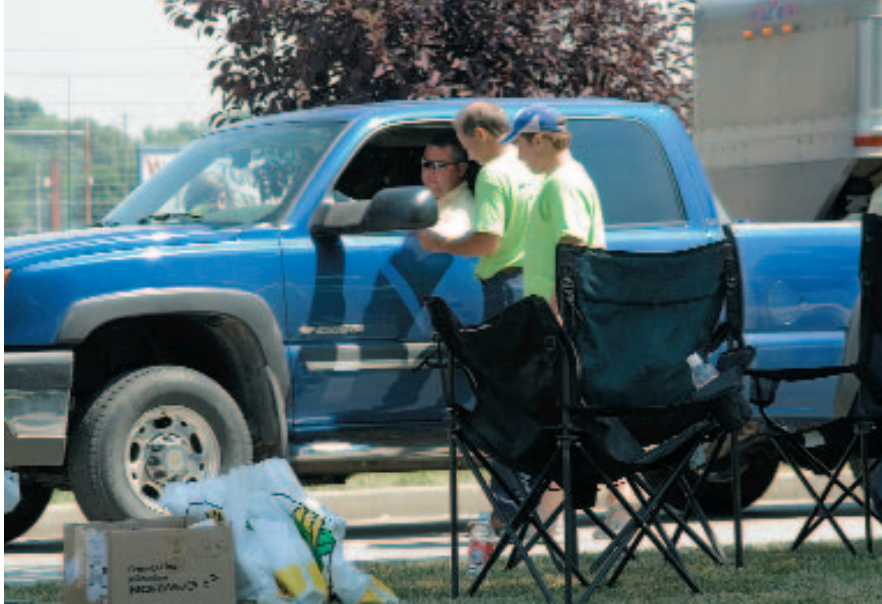
►As exhibitors reached their destination and pulled into the Indiana State Fairgrounds Sunday and Monday, volunteers from Indiana met them to provide directions and answer questions. The Indiana hosts were highly visible wearing their fluorescent green shirts.