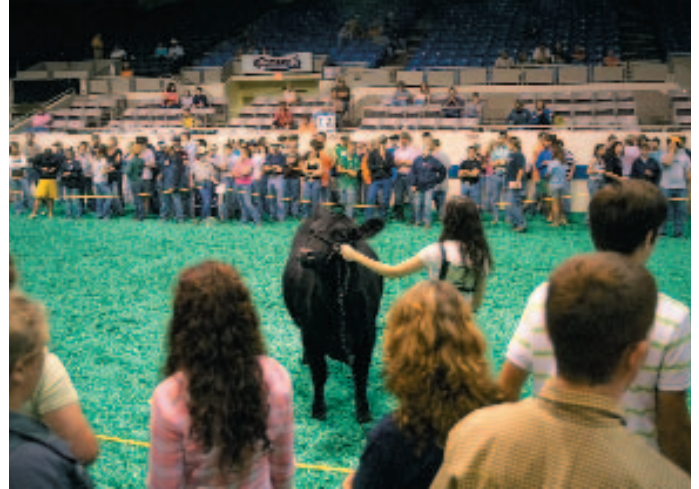
►Above: Tuesday's livestock judging competition sponsored by the Indiana adult and junior Angus associations was a popular venue, with 342 juniors participating.