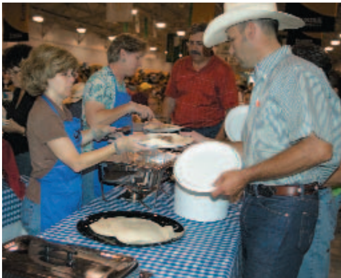
►Hungry Angus enthusiasts gathered in the Our Land Pavilion at mealtime. State groups sponsored various meals throughout the weeklong event.