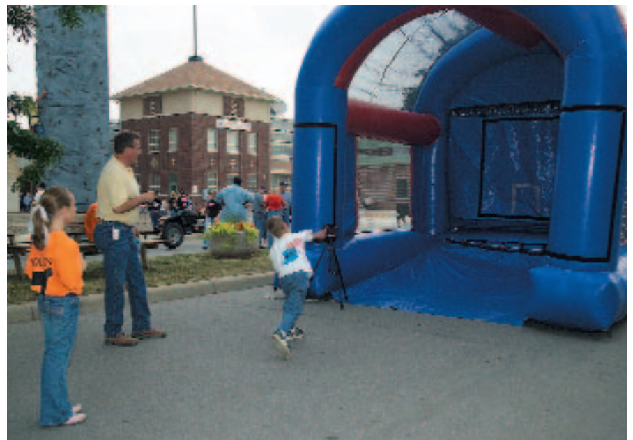
►A live band and a variety of games helped entertain kids of all ages during the Street Party Monday night following Opening Ceremonies.