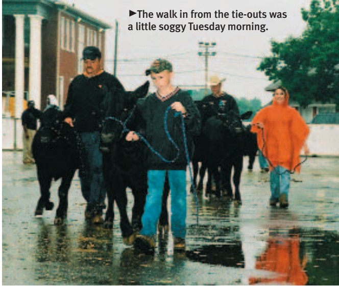
►The walk in from the tie-outs was a little soggy Tuesday morning.