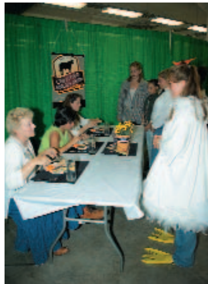
►Left: Contests, including the Auxiliary-sponsored All-American Certified Angus Beef® Cook-Off, took center stage Tuesday. In addition to the cattle show, the NJAS featured 14 life skills competitions.