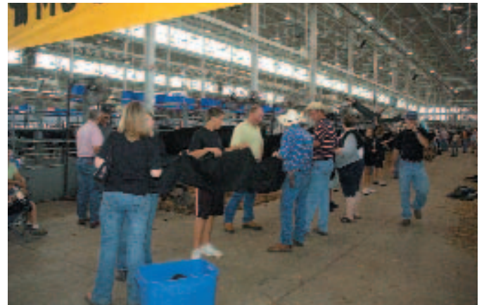
►Above: Sunday and Monday were designated arrival days. Angus juniors and their families unloaded trailers and set up their stalls with others from their state.