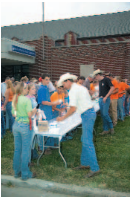
►The Nebraska juniors hosted an ice cream social following Opening Ceremonies Monday evening.