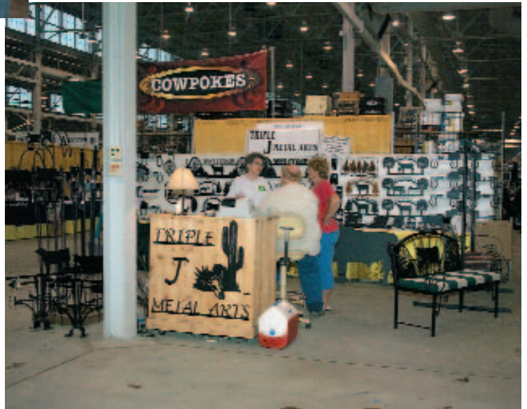
►Trade show exhibitors offered a variety of goods and services — from belt buckles to benches, china to T-shirts, and show foam to hydraulic chutes.