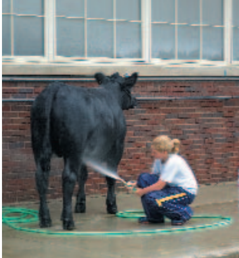
►Left: What goes on must come off. Juniors and their parents spent as much time on the wash rack as in the ring.