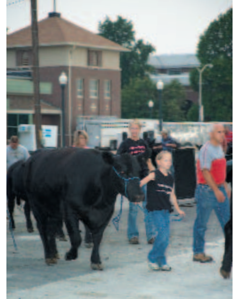
►Trips to and from the tie-outs were an everyday occurrence.