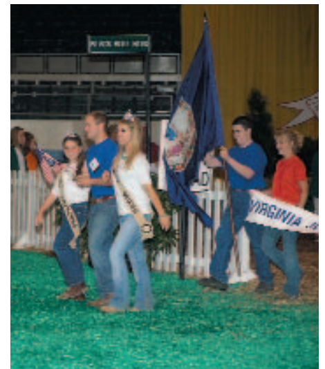
►Left, above, right: During Monday night's Opening Ceremonies, state groups displayed their enthusiasm, introduced their Board Candidates and royalty, and poured gifts on the crowd during the Parade of States.