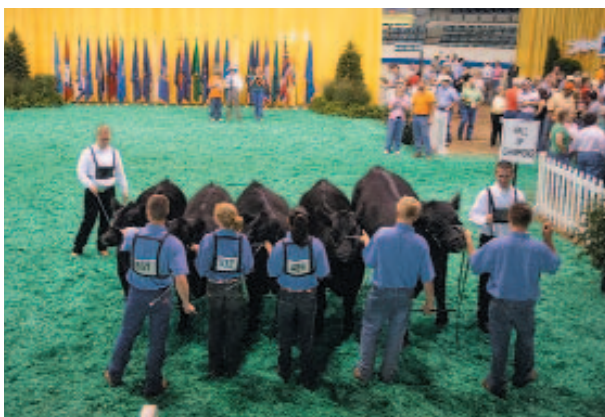
►The cattle show kicked off Wednesday morning with the judging of the steers, cow-calf pairs and bred-and-owned bulls. Bred-and-owned heifers showed Thursday, and the owned heifer show took place Friday and Saturday.