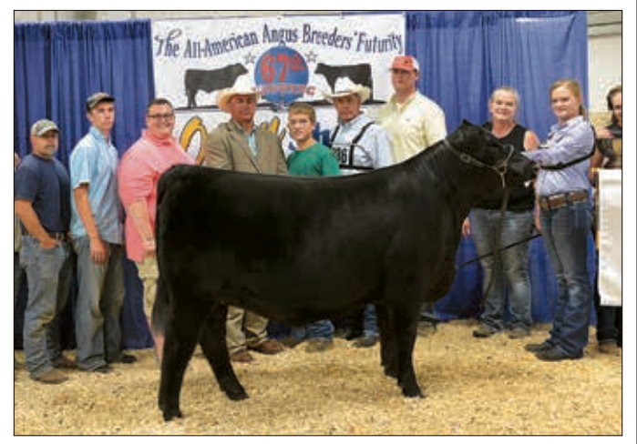
► Grand champion female, DAJS Lady Empress 537.