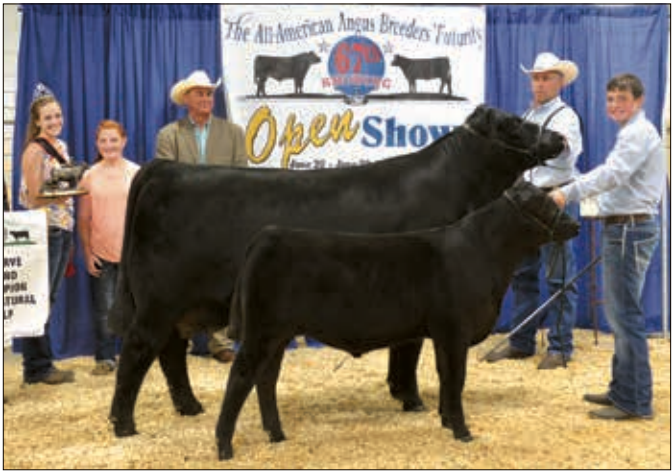
▶ Reserve grand champion cow-calf pair, Cherry Knoll Pleasant Elsa.