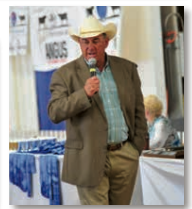
►Blanchard evaluated 92 females, 24 bulls and eight cow-calf pairs before choosing winners.