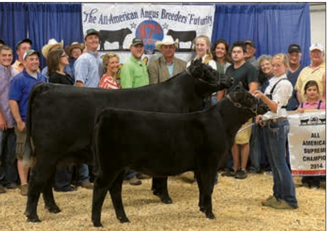
Supreme champion and grand champion cow-calf pair, Champion Hill Georgina 8154.