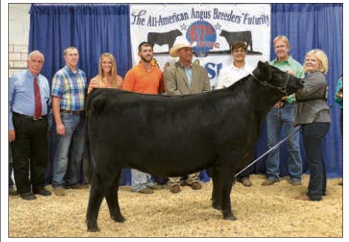
► Reserve grand champion female, ARF Lady 4035.