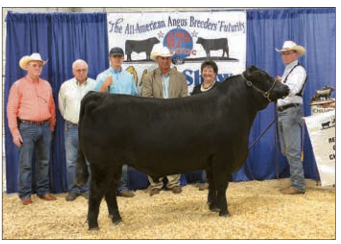
► Reserve grand champion bull, Sankey's Guardian 322.