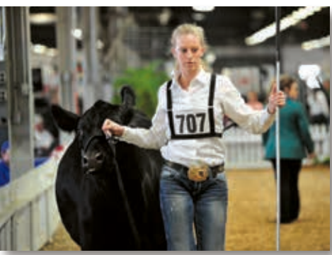
►A calm showman walks her heifer around the ring.