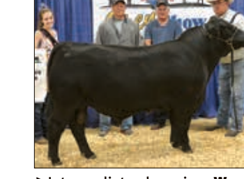
► Intermediate champion, Wood ruff Cherokee 34, by Woodruff Angus Farm, Milton, Iowa.