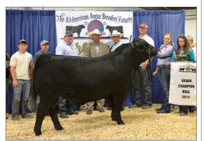
► Grand champion bull, DAJS After Burn 714.