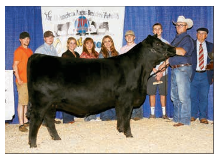
► Grand champion female, Cherry Knoll Elsa 1610.