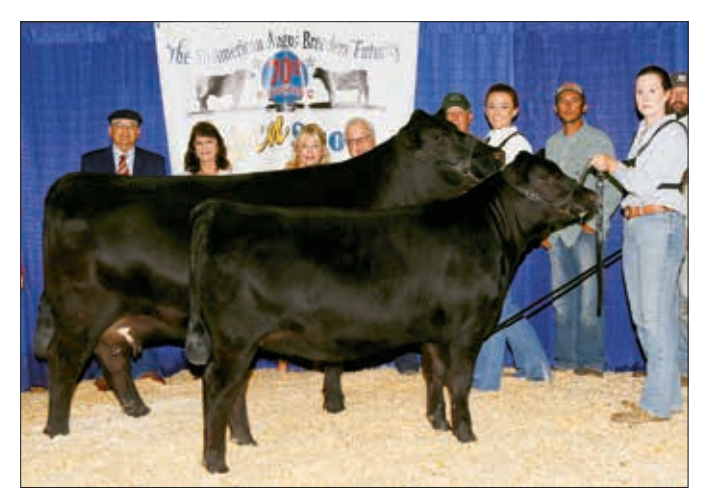
► Grand champion cow-calf pair, DS Lady Peak Dot 0354.