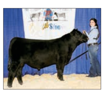
Senior calf champion, CCC Blue Blood D553 , by Cheyenne Jones, Campbellsville, Ky.