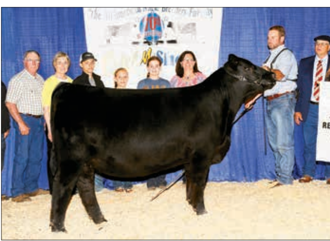
▶ Reserve grand champion female, Dameron Northern Miss 6144.