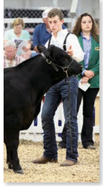
► National Junior Angus Board members are on hand to assist in the ring if needed.