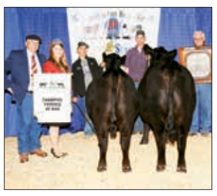
▶ Progeny of Covell's Cheyenne 0523 won produce of dam — maternal for Dameron Angus Farm.