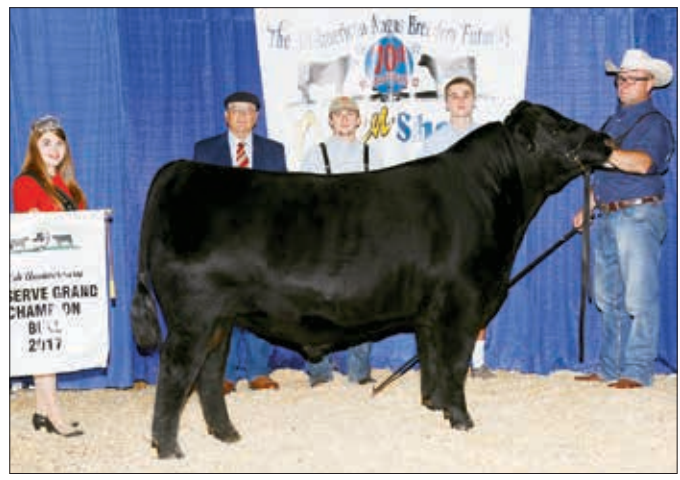
▶ Reserve grand champion bull, Cherry Knoll Brennen 1609.