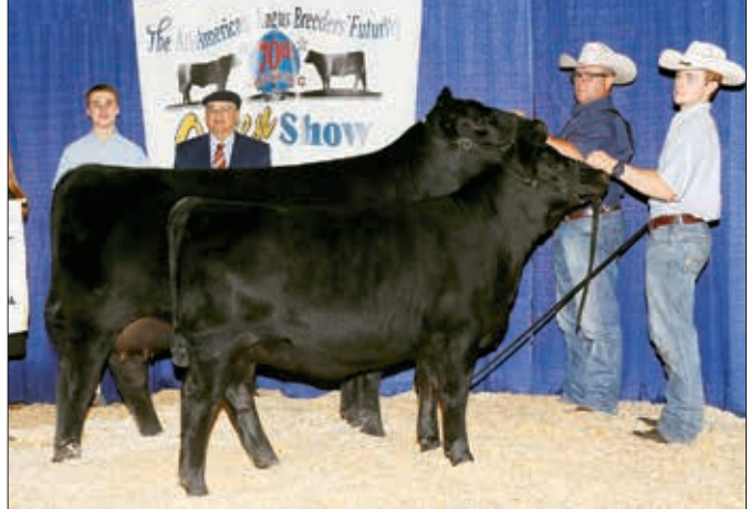
Reserve grand champion cow-calf pair, Cherry Knoll Lady 1481.