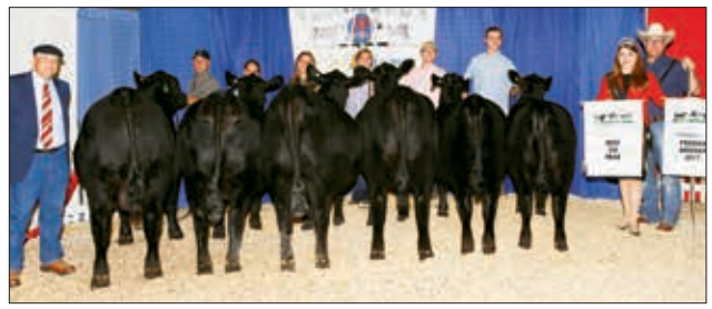
First-place best six head and Premier Breeder honors were won by Cherry Knoll Farm.