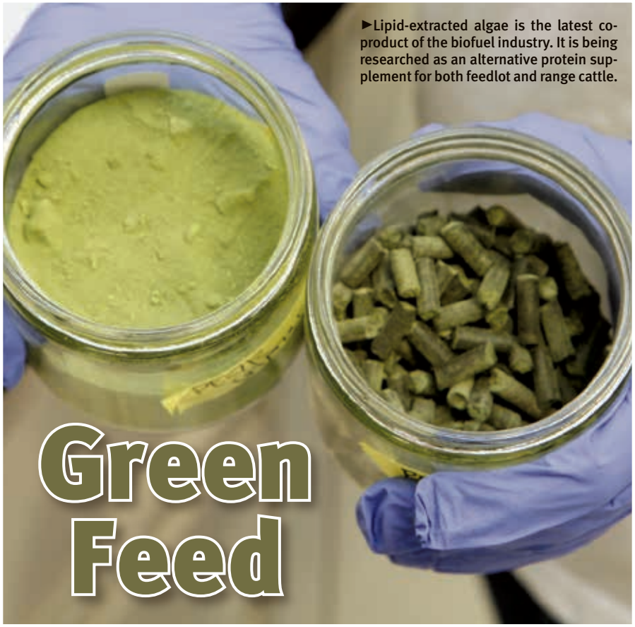
►Lipid-extracted algae is the latest co-product of the biofuel industry. It is being researched as an alternative protein supplement for both feedlot and range cattle.