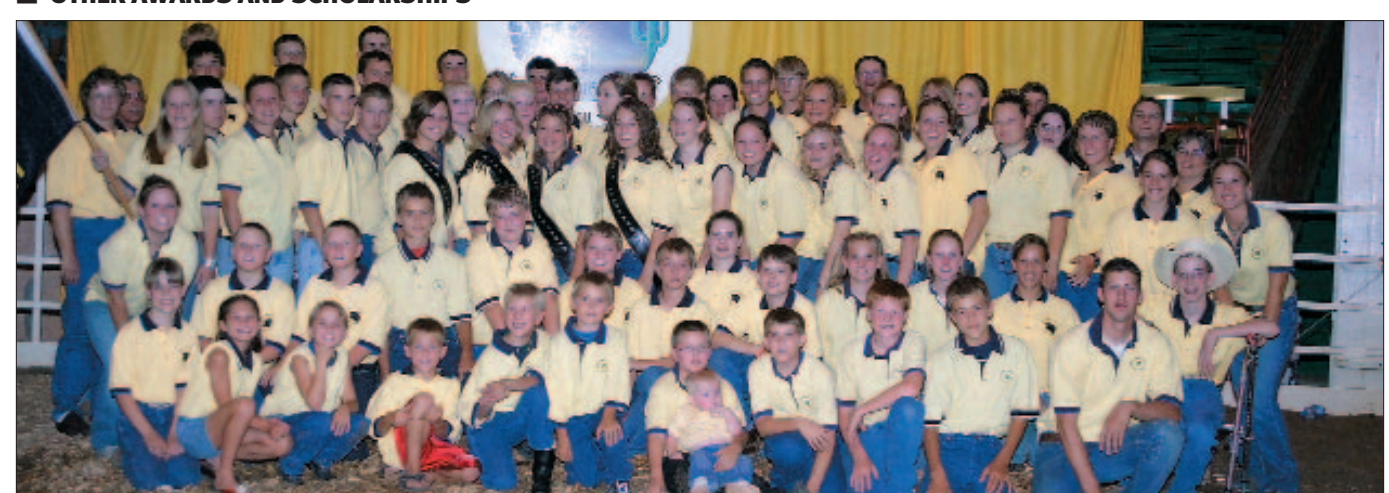
▶The Kansas Junior Angus Ass'n captured the Sweepstakes Award for the ninth time. Kansas juniors also submitted the third-place scrapbook.