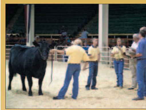
▶ Like the Public Speaking Contest, team sales has progressed into a popular and competitive contest at the NJAS. Ten junior teams, 11 intermediate teams and 10 senior teams competed within their respective age divisions. The key to this contest is to market an animal to a panel of judges. Senior division competitors receive their scenarios two days prior to the contest.