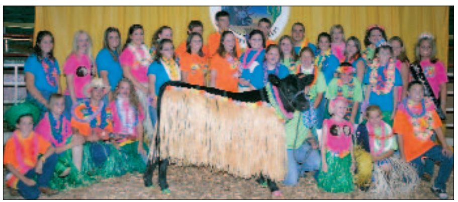
► The Arkansas Junior Angus Ass'n won first place in herdsmanship with 31-45 head of cattle.