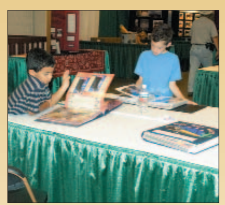
► States, rather than individuals, compete in the scrapbook contest. Providing another opportunity to participate for members unable to travel to the show to compete, the contest encourages recordkeeping.