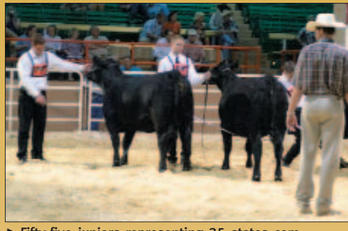
► Fifty-five juniors representing 35 states competed in the National Junior Angus Showmanship Contest that is sponsored in part by the Auxiliary, the Ham James Memorial and Andis Co.