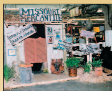
▶ The herdsmanship award recognizes those states that go the extra mile to manage the size of their "herd" at the show, while at the same time keeping their area clean, promoting their state and working to maintain a positive atmosphere.