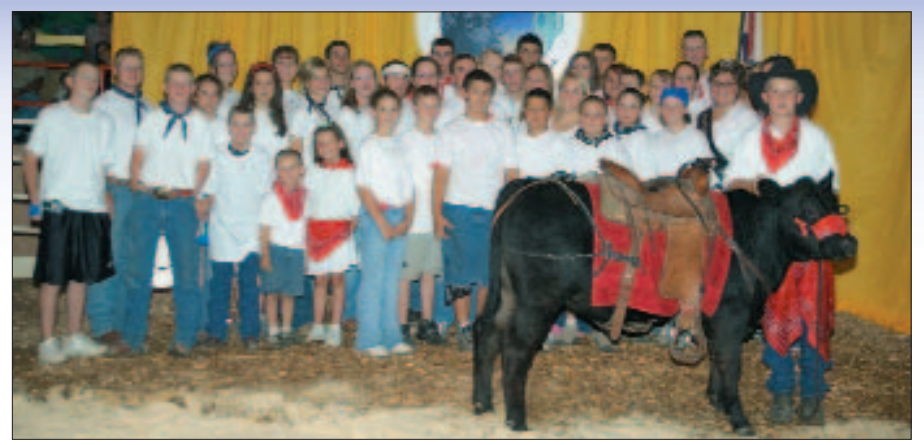
►The Missouri Junior Angus Ass'n captured first place in herdsmanship for 46 head of cattle or more. Missouri juniors also submitted the first-place scrapbook.