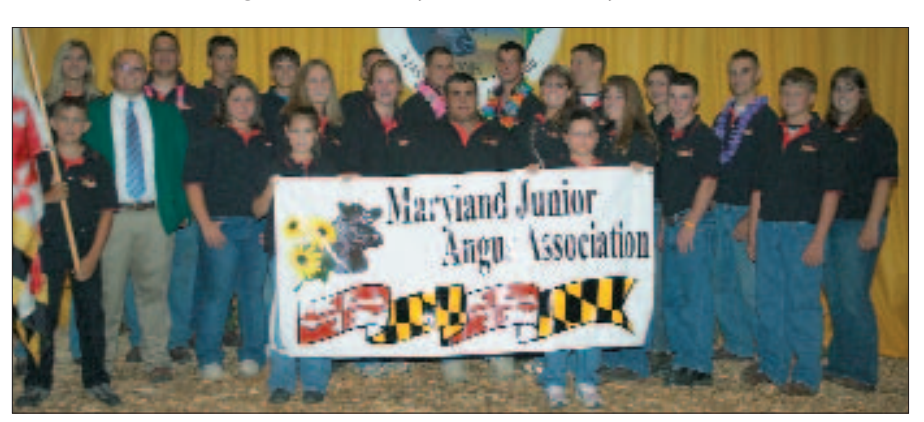
►The Maryland Junior Angus Ass'n won first place in herdsmanship with 16-30 head of cattle. Maryland juniors also submitted the second-place scrapbook.