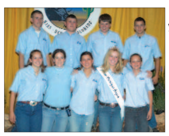
►The Michigan Junior Angus Ass'n won first place in herdsmanship with 15 or fewer head.