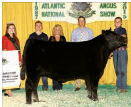
► Grand champion B&O steer, Cherry Knoll Class 1428.