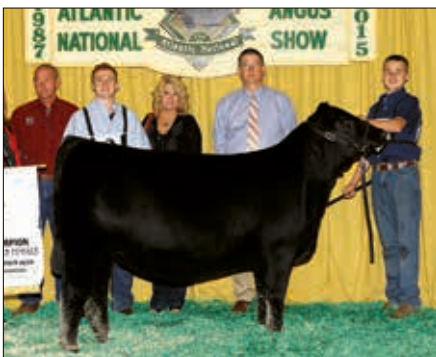
► Grand champion B&O female, Cherry Knoll Rosebud 1454.