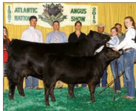
► Grand champion cow-calf pair, Champion Hill Georgina 8092.