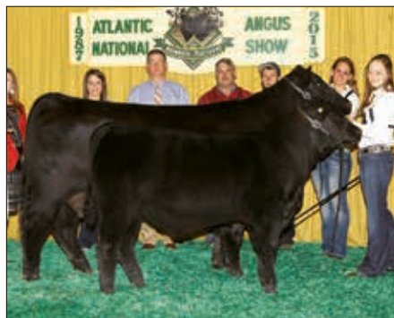
►Reserve grand champion cow-calf pair, Frey's Cheryknol Arkpride U41.