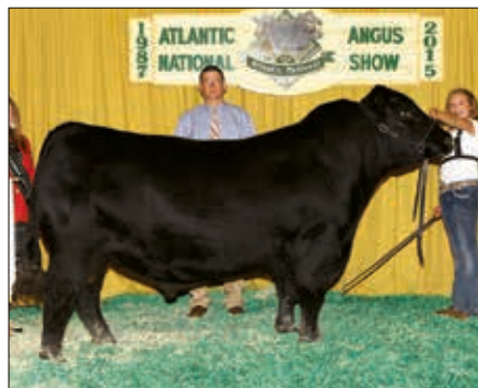
►Reserve grand champion B&O bull, Destiny's Sound 38.