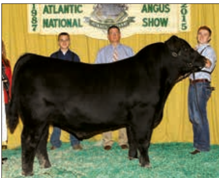
► Grand champion B&O bull, Cherry Knoll Brigade 1404.