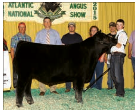
► Grand champion steer, Triple N Black Label B517.