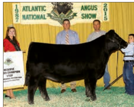
►Reserve grand champion steer, PVF Priority 4089.