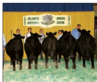
► State group of five, Illinois Jr. Angus Ass'n .