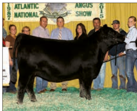
►Reserve grand champion owned female, SCC SCH Phyllis 426.