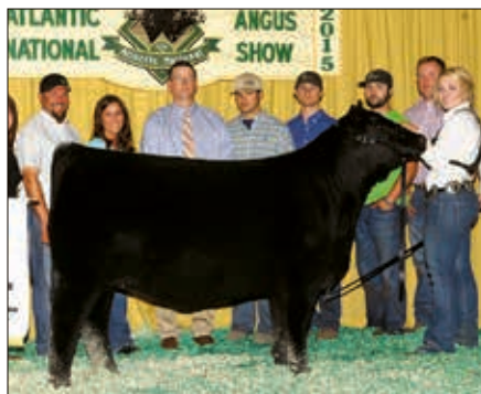
► Grand champion owned female, Seldom Rest BRMF Bardot 890.