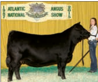
► Senior heifer calf champion, LRD Georgia 3676 , by Lydia Dance.