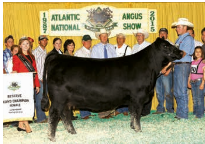
► Reserve grand champion female, Champion Hill Georgina 8547.