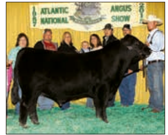
► Late-spring calf champion, AHFF the Gambler 401B , by Heart Felt Farms, Gettysburg, Pa.