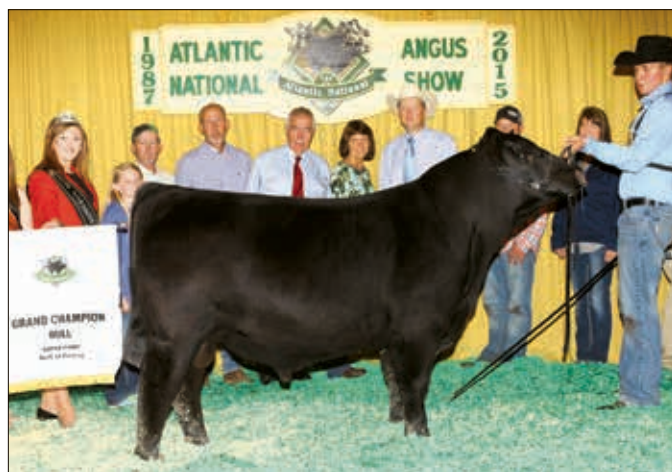
► Grand champion bull, DDA Gemstone 1439.