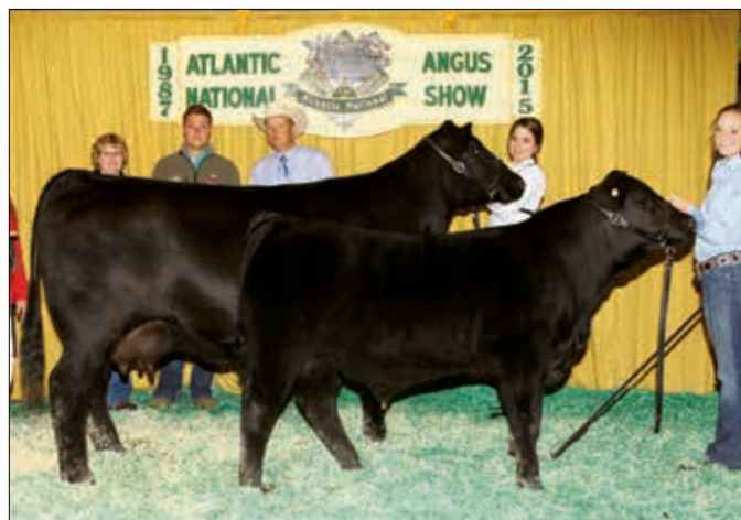
► Grand champion cow-calf pair, Frey's Cheryknol Arkpride U41.