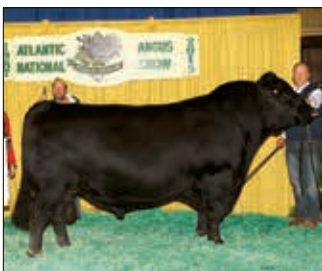
► Senior champion, PRF MVR Mayhem 1566 , by Maple Valley Ranch, Cumberland Furnace, Tenn.; Destiny Angus Farm, Columbia, Tenn.; and Pine Row Farms, Bon Aqua, Tenn.