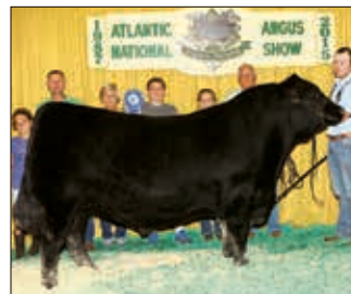
► Junior champion, Wood Capone 2300 , by Wood Angus Farm LLC, Willow Spring, N.C.