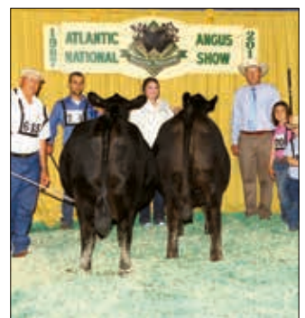
► First place produce-of-dam, progeny of SAV Blackbird 5296 , by Champion Hill.