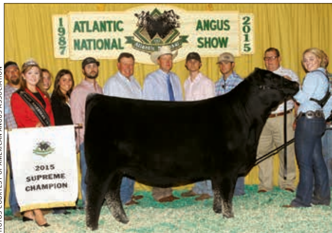
► Supreme and grand champion female, Seldom Rest BRMF Bardot 890.