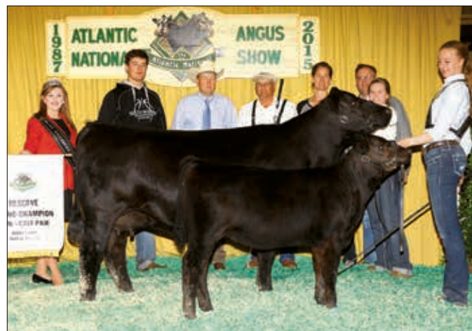
► Reserve grand champion cow-calf pair, Champion Hill Georgina 8092.