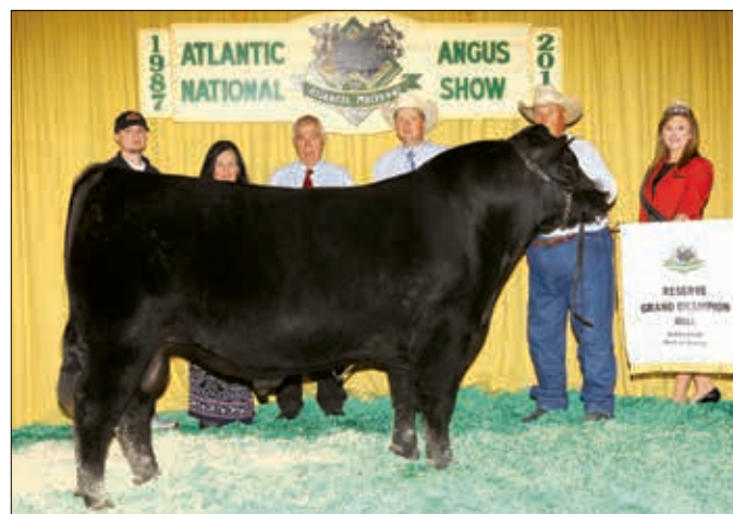
► Reserve grand champion bull, APS Press Man.