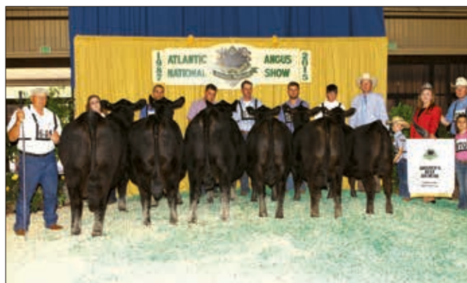
► Best six head, Champion Hill .