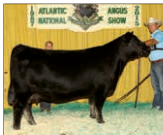
► Reserve junior champion, PVF Blackbird 3071 , by Austin Nowatzke.