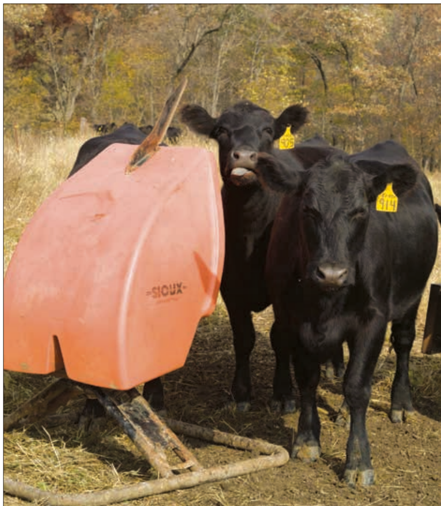
► Producers must remember that managing for successful reproduction is a year-round process. By managing cattle well throughout the year, particularly with regard to nutrition, producers are managing their animals’ endocrine systems and the multiple hormones that influence fertility.